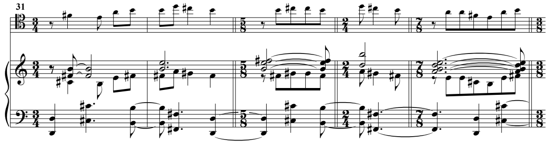
[Example 66: Prelude IV, mm. 31-35]

A new ostinato figure in the piano in mm. 38-43 sets up a return of material from the opening of the Prelude. Ornstein's indication of Tempo I o at m. 44 is interesting in that he never noted a different tempo anywhere else in the movement, although the marking does serve to call attention to the return. As in other preludes lacking tempo or dynamic markings, Ornstein may have left it up to the performers to interpret their own changes in tempo. At the Tempo I o , m. 44-54, the right hand takes on the main melody, in octaves, reminiscent of the cello's melody in m. 5, while the left hand accompanies with arpeggiated eighth-note quintuplets (Example 67). Adding a third layer, the cello's new countermelody helps to create a lush version of the opening.