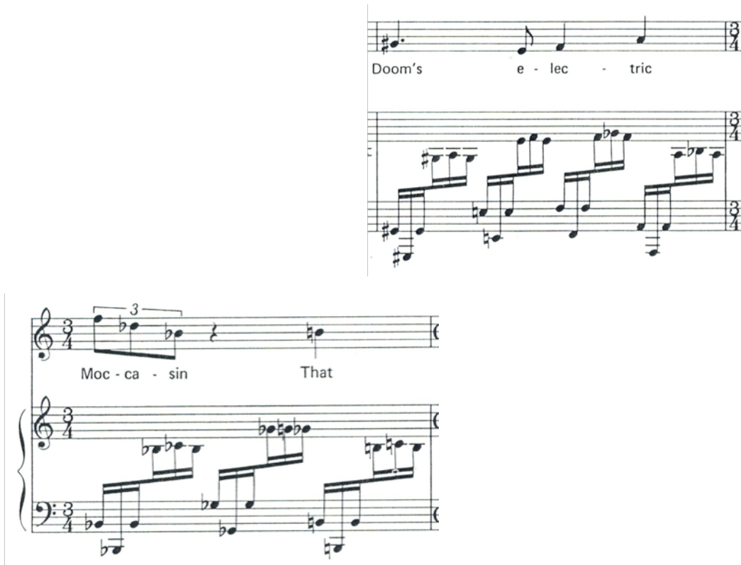
Figure 5. Snake Motive, mm. 15-16. (Used by permission of Southern Music Publishing Co., Inc.)

A substantial mood shift occurs at measure 30, where the piano and voice are both marked "un poco più mosso, marcato," and the piano suddenly plays eighth-note triplets in wide-spaced arpeggios. The final mood of the piece is created in measure 41, in which inversions of chords within C Major indicate a newfound sense of peace after the preceding storm. Neubert notes that Hoiby's "use of an expansive triple or compound meter" is "prevalent" in climactic sections of his music. 96 In this section, the meter shifts to 6/4 in the accompaniment to further the sense of calm.