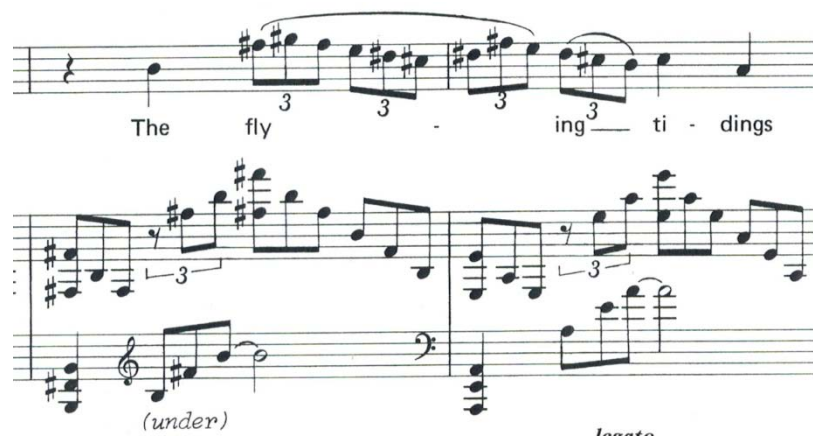
Figure 6. Melisma on "flying tidings," mm. 32-33. (Used by permission of Southern Music Publishing Co., Inc.)

A few instances of sixteenth-notes in the vocal line occur to emulate speech patterns, as mentioned above. Rhythmically, words like "quivered" (m. 5) and "up-on" (m. 8) are treated in a similar fashion to more accurately reflect the word stresses of the English language. Other speech-like settings involve eighth-note triplets, as may be seen in Figure 5 ("Moccasin," m. 16). One true example of text painting is set on the melismatic setting of "fly-ing" (mm. 32-33); the voice "soars" to represent "flying tidings." It is the only example of text painting on this word in the three songs studied. Figure 6 shows this melisma.