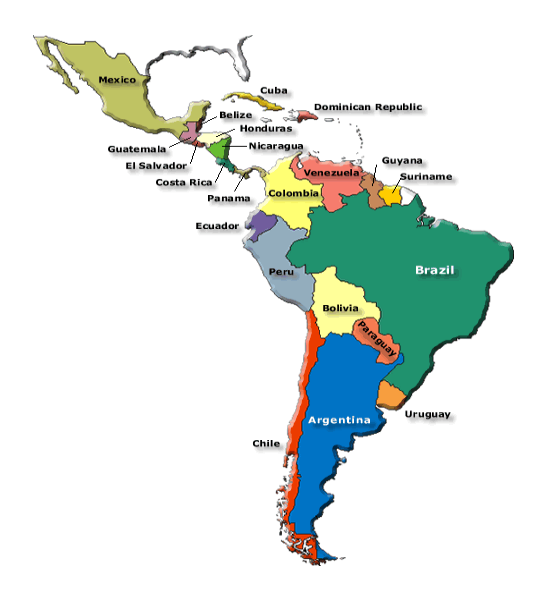
Fig. 1 Map of Latin America<sup>8</sup>

The development of eclectic music in Latin America during the twentieth-century produced very distinguished performers, especially in the most traditional instruments such as piano, violin and clarinet. Nevertheless, classical saxophone did not enjoy any level of public exposure nor any significant repertoire until the 70's and 80's. With some exceptions in Brazil, Argentina, Venezuela and Cuba, where important composers approached the instrument early in the twentieth century, the saxophone was primarily used as a jazz instrument and, consequently, it was often featured in popular music.<sup>9</sup>