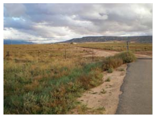
Figure 3. No Water Mesa, Arizona

Growing up Diné in No Water Mesa, Arizona