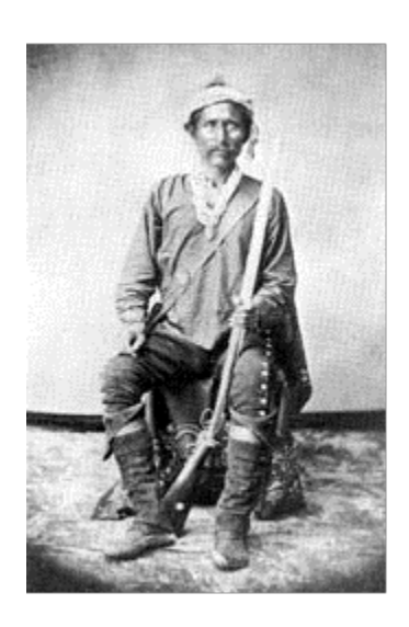
Figure 2. Chief Barboncito

"I hope to God you will not ask me to go to any other country accept my own."