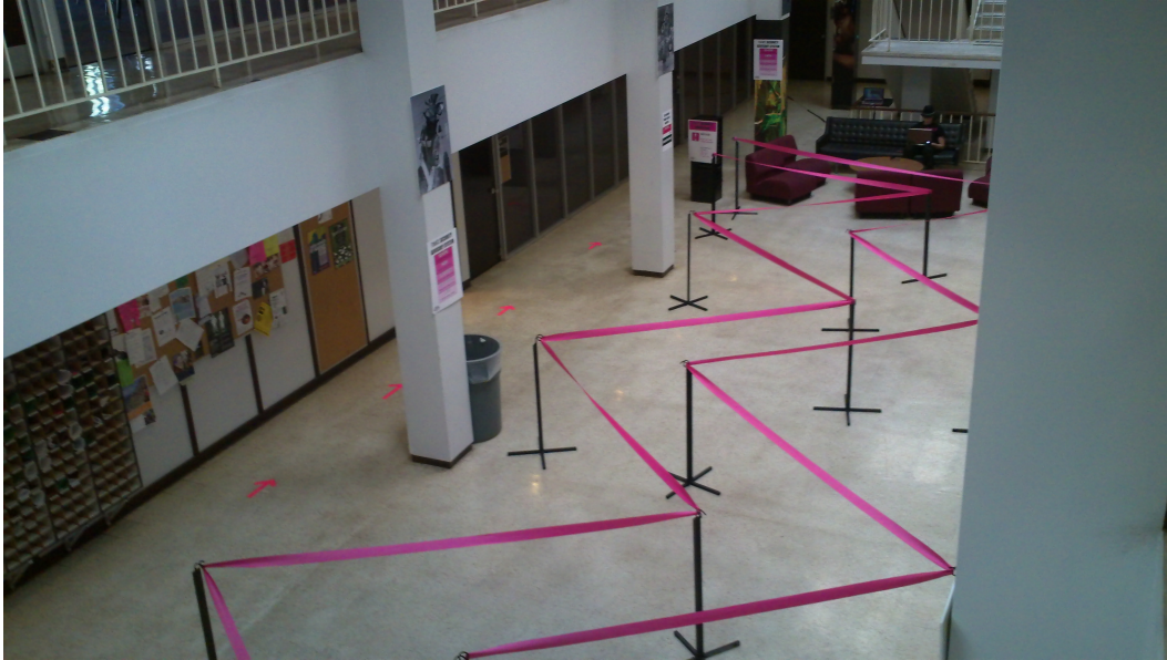
Figure 1: Security Lines in PEBE Lobby

accentuate the presence of surveillance within the piece. Once inside the main performance space, the audience viewed a live feed of the security checkpoint.