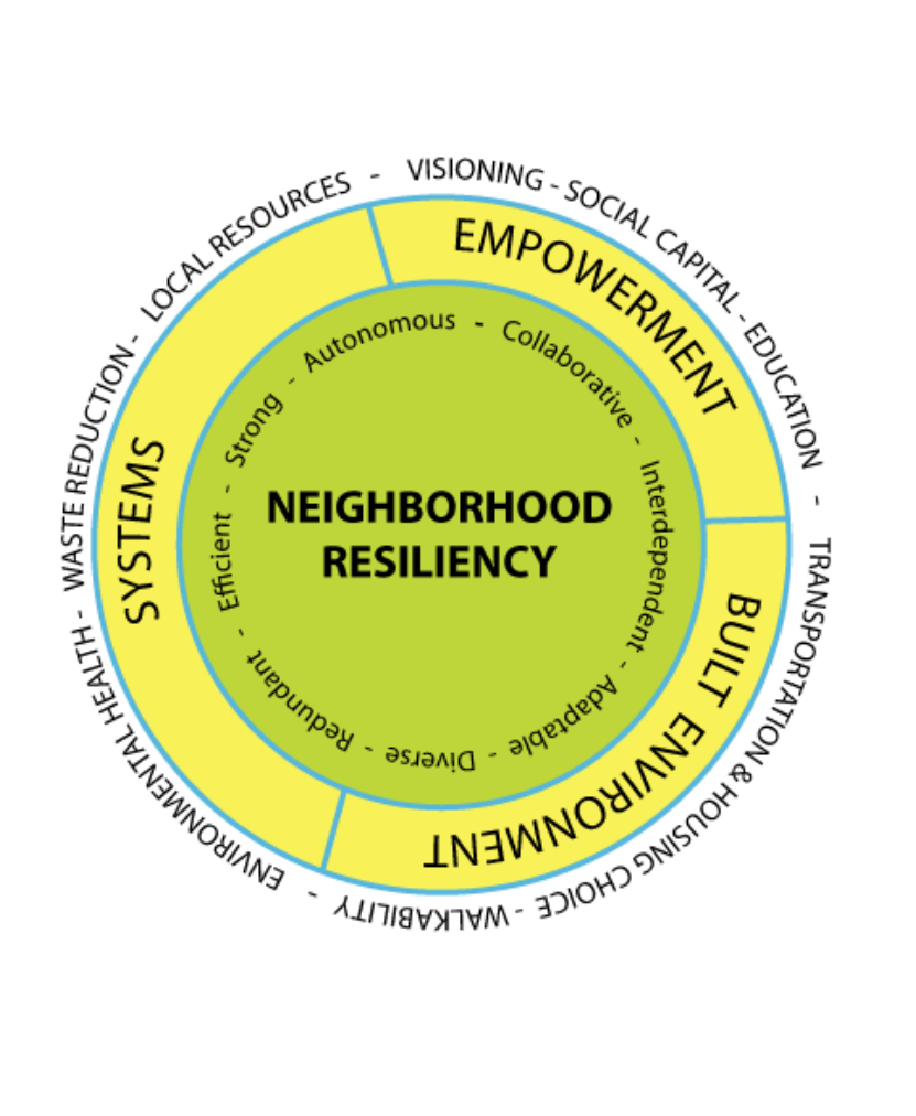
Figure 1: Visualization of Neighborhood Resiliency Framework