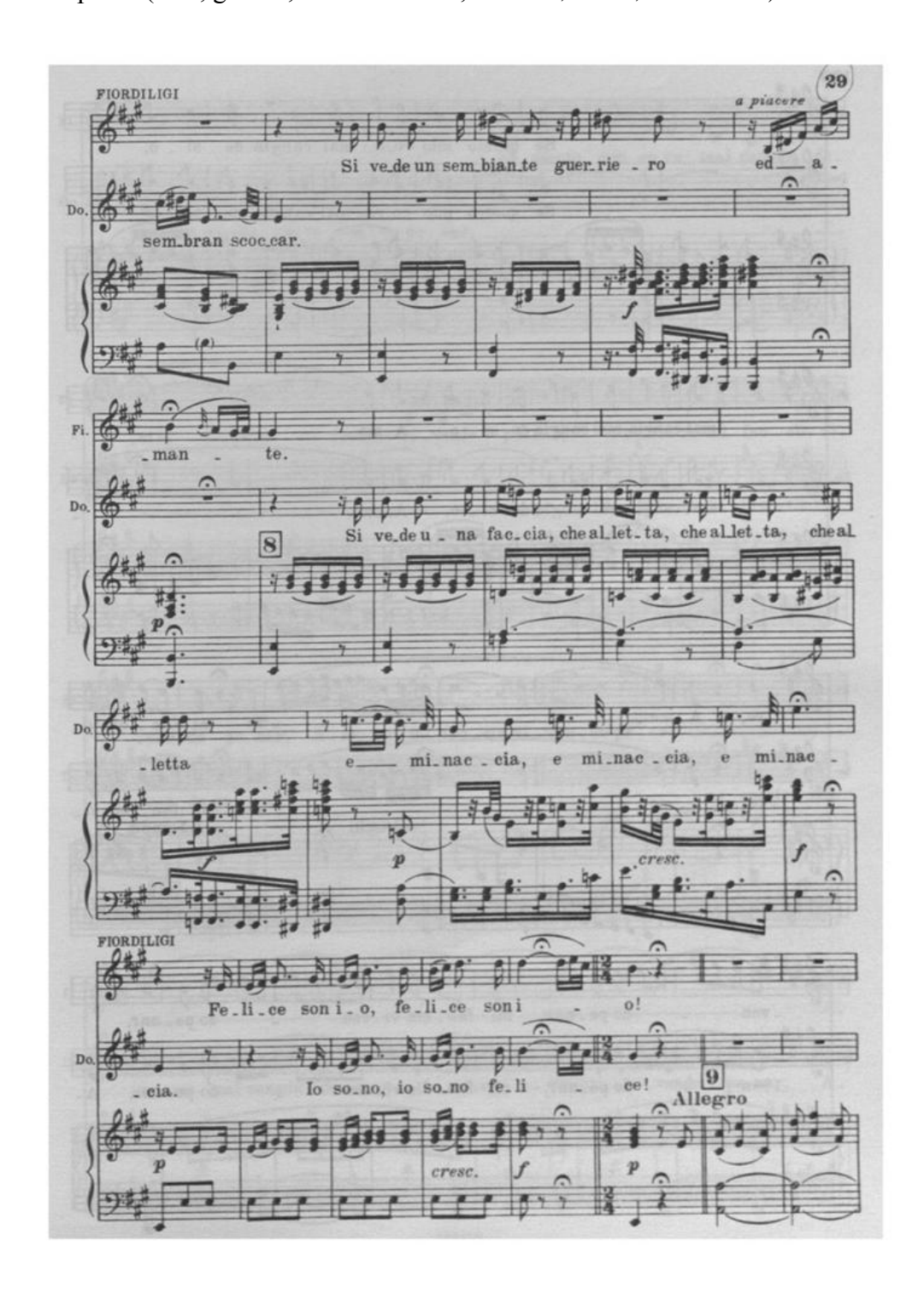
Example 2 ("Ah, guarda, sorella" Act 1, scene II, No. 4, mm. 49-73)<sup>42</sup>