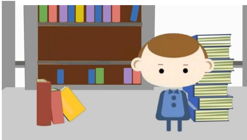
Figure 2 Example of Story Narrative Condition