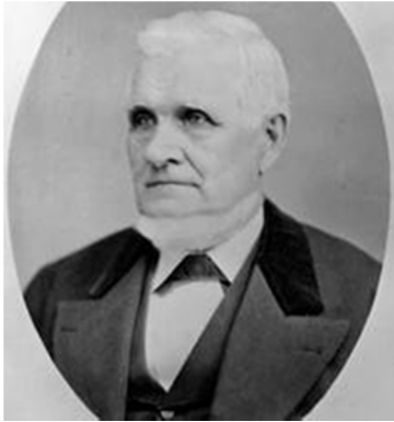
Figure 3. John Taylor

Another thought that helps provide context for the eventual return of the Mormon people to Nauvoo was spoken by John Taylor (pictured in Figure 3), who would become the third president of the Mormon church: