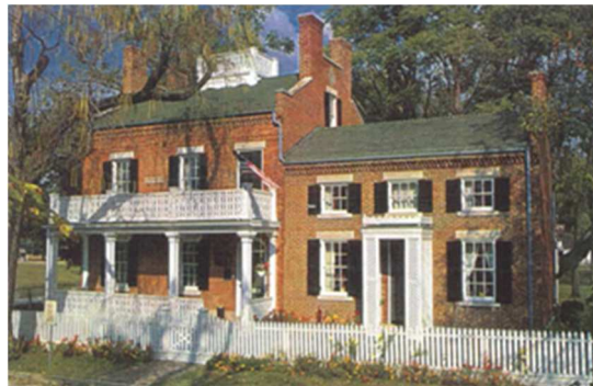
Figure 8. Heber C. Kimball Home after restoration