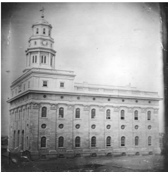
Figure 1. Public Domain, Early photograph of the Nauvoo Temple circa 1846-47

As if the early settlers of Nauvoo weren't suffering enough, they now had a directive to build a temple from their own resources to a magnitude that far exceeded any