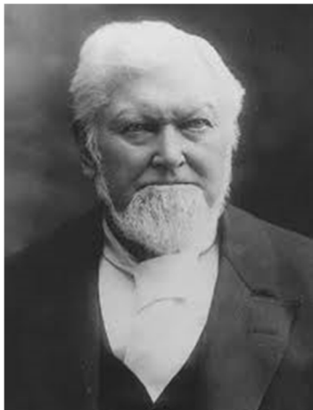
Figure 2. Wilford Woodruff - Washington County Historical Society

Following the deaths of Joseph and Hyrum Smith, Brigham Young assumed leadership of the Church. Given the circumstances, it would be understandable that the Saints would want to flee the area for their own safety, but it would be almost two years later before they were eventually driven out. In the meantime, as a memorial to their prophet Joseph Smith, and as a symbol of the Saint's adoration of their God, they completed the temple and continued to construct buildings. As a true memorial to Joseph Smith, the name of the city was changed at the time to "The City of Joseph", however, this title did not continue into the twentieth century and the name of Nauvoo continues today. There was a sense among the Saints that anything they could build or any beauty they could create would further memorialize the memory of the prophet Joseph Smith (Leonard, 1992). Consequently, many structures were built which played directly into the future restoration of the site.