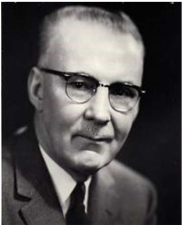
Figure 6. Dr. J. LeRoy Kimball, date unknown.

effort was made to assure that as far as possible, the end result would be a temple that was as true to the form of the original temple as possible. Although difficult to measure, the exterior of the reconstructed temple appears to be an accurate replica of the original. While entrance inside the temple is limited to members of good standing, the Nauvoo temple, pictured in Figure 5, draws thousands of visitors each year.