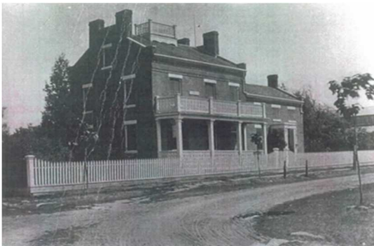
Figure 7. Heber C. Kimball Home before restoration

From its beginnings, the purpose of NRI was clear: “ To restore the Mormon Temple at Nauvoo as a shrine to those whose perseverance and faith built it, and to