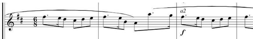
Figure 4.3: Waltz 1. Flute I, measures 91-94, from O'Connor, The Fiddle Concerto for Violin and Orchestra , 9.

W2 begins with three descending notes often ornamented with a downward leap of a sixth between them (Figure 4.4).