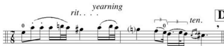
Figure 4.13 Movement II Composed Rubato in Solo Part. Solo Violin, measures 38-39, from O'Connor, The Fiddle Concerto for Violin and Orchestra , 82 (excerpt in treble clef).

Measures 38-39 contain a complex combination of dotted rhythms under triplet barring and grace notes. However, in recordings of O'Connor playing the piece this measure sounds like a moment of free embellishment before the piece moves on to the next idea. 131 While this is a small section within the larger piece, it is an example of the way O'Connor endeavored to make the Fiddle Concerto accessible for other violinists to perform effectively by notating exactly what he wanted and eliminating the possibility for confusion in interpretation.