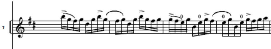
Figure 4.6: Movement I Solo Figuration with Hemiola. Solo Violin, measures 229-230, from O'Connor, The Fiddle Concerto for Violin and Orchestra , 24.

Classical violin soloists work to avoid accenting string crossings, but fiddle players embrace accents on weak beats and string crossings.