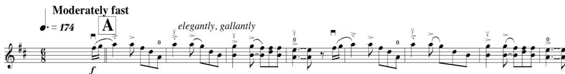
Figure 4.14: Movement III Jig Melody. Solo Violin, measures 1-9, from O'Connor, The Fiddle Concerto for Violin and Orchestra , 102.

O'Connor crafted his main Jig Theme ("J") by re-structuring Melody 1 from the second movement. For thematic discussion in this portion of the chapter the opening melody from movement two will be called "2." Just as Melody 2 had two repeated A notes followed by a descending pattern, so does the J Theme feature two repeated As followed, in this case, by a descending arpeggio. Melody 2 and the J Theme are related on a larger scale as well: The repeated A notes in the movement two melody correlate to the first full measure of the J Theme with its D arpeggio. Melody 2 then drops to G, and the J Theme similarly follows this shape, with the descending G arpeggio. Finally, the last four notes in Melody 2, G-F-natural-E-A, are also in the third and fourth measures of the J melody. 141 The haunting loneliness of the slow movement is transformed into a bright, upbeat theme with the addition of the F-sharp and the jaunty 6/8 jig rhythm (Figure 4.14).