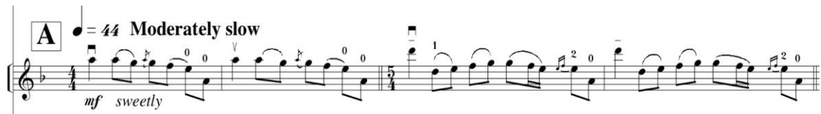
Figure 4.10 Movement II Solo Melody 1. Solo Violin, measures 1-4, from O'Connor, The Fiddle Concerto for Violin and Orchestra , 77.

The plodding rhythmic figure gives way to the gently-lilting 6/8 feel of melody 2, with gentle downward leaps of a fifth followed by descending stepwise motion (Figure 4.11).