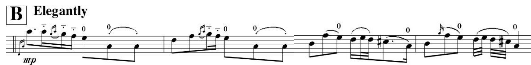
Figure 4.12: Movement II Solo Embellishment. Solo Violin, measures 27-20, from O'Connor, The Fiddle Concerto for Violin and Orchestra , 80-81 (excerpt in treble clef).

O'Connor composed the solo violin part for movement two with the same stylistic techniques he used in movement one, especially heavy embellishments. The slower tempo of this middle movement allows more room for complex combinations of grace notes, turns, and mordants. Take, for example, measures 27-30 of the solo violin part (Figure 4.12).