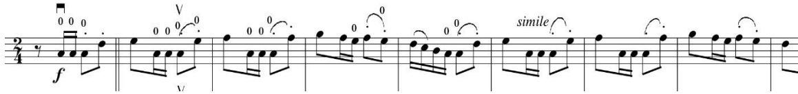
Figure 4.1: Hoedown 1. Violin I, measures 1-9, from The Fiddle Concerto for Violin and Orchestra , Bonsall, CA: Mark O'Connor Musik International, 1999, by Mark O'Connor, 1.

Using contrary motion, H2 compliments the upward-leaping H1 with five legato descending notes (Figure 4.2).