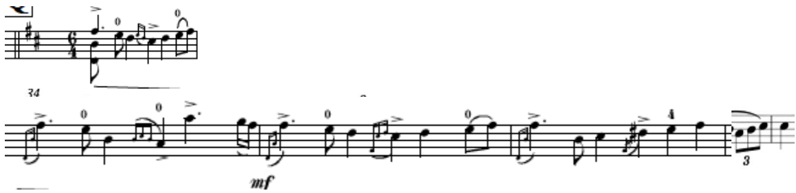
Figure 4.8: Movement I Solo Waltz Embellishment. Solo Violin, measures 386-389, from O'Connor, The Fiddle Concerto for Violin and Orchestra , 42-43.

The intricate sound is something the audience might hear during the waltz portion of a fiddler's contest round, such as Laura Houle's transcription of O'Connor's version of the tune "Yellow Rose Waltz" (Figure 4.9).