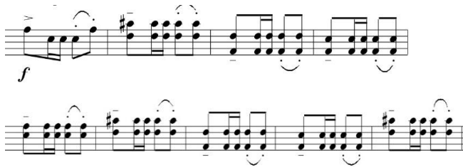
Figure 4.7: Movement I Solo Part with Double Stops. Solo Violin, measures 503-511, from O'Connor, The Fiddle Concerto for Violin and Orchestra , 59-60.

The effect of the fourths and fifths sounds similar to open-string drones, but the double stops are much more difficult to play in tune.