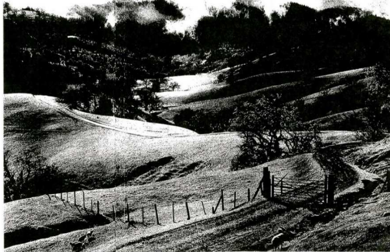
Figure 1. Ansel Adams, Pasture, Sonoma, County, California , circa 1957, gelatin silver print, 27.2 x 32.7 cm. Adams and Newhall, This Is The American Earth , 48, 49.

Shall we not learn from life its laws, dynamics, balances? Learn to base our needs not on death, destruction, waste, but on renewal? In wisdom and in gentleness learn to walk again with Eden's angels? Learn at last to shape a civilization in harmony with the earth!