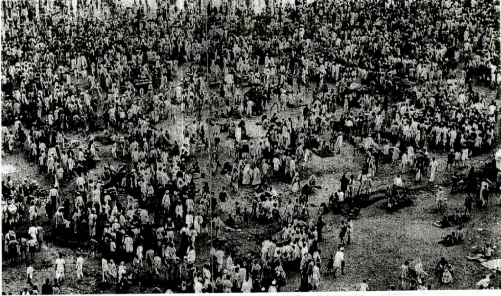
Figure 3. Ferenc Berko, Bathers on the Ganges , no date. Adams and Newhall, This Is The American Earth , 42, 43.