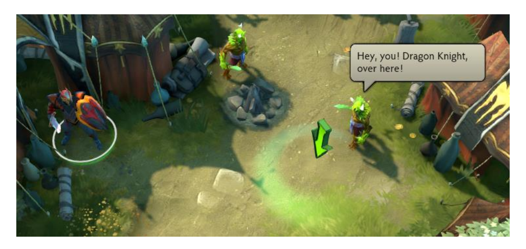
Figure 4. Triggering the Next Learning Event. A green arrow flashes on the location the player needs to move to in order to progress; this arrow is combined with the text over the NPC.

In the second module, players are told to move their hero to a specific location (Figure 4.4). The game uses a flashing green arrow to show where to move, drawing the player's attention to the right spot [Clear Goals Principle]. The first three times the player is supposed to move, this green arrow appears at the location [Developing Strategies Principle]. Subsequent movements do not include this indicator. The game uses showing (where to move) to provoke player interaction.