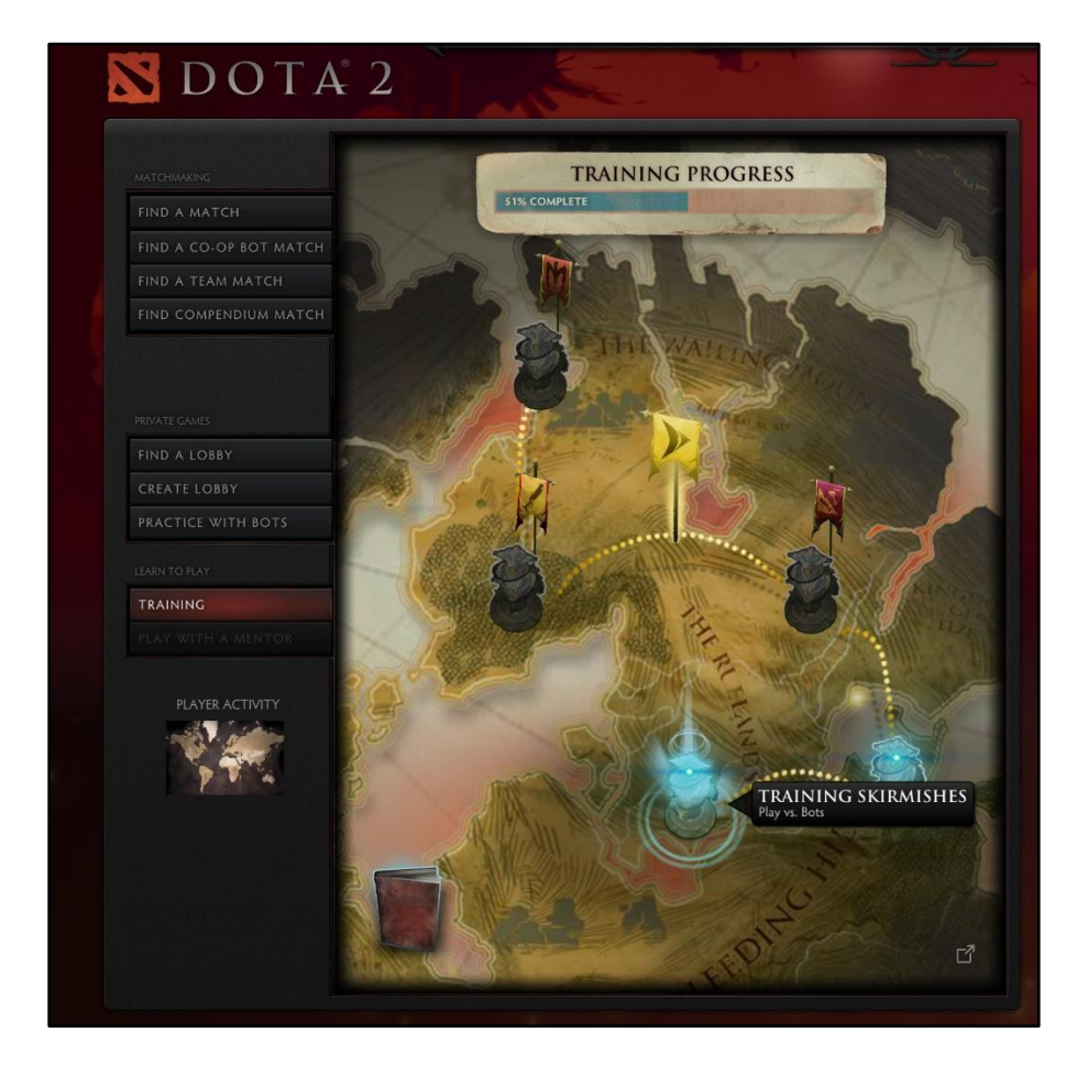
Figure 2. Tutorial Map. The tutorial map provides a conceptual metaphor for the organization and sequence of the training modules

with each tower (module) connected by a path to the next (see Figure 4.2). The map even suggests a hierarchical distinction between the modules, with the four top modules (which cover basic gameplay topics) separated by a river from the bottom two (which cover more advanced material) and the special battlegrounds.