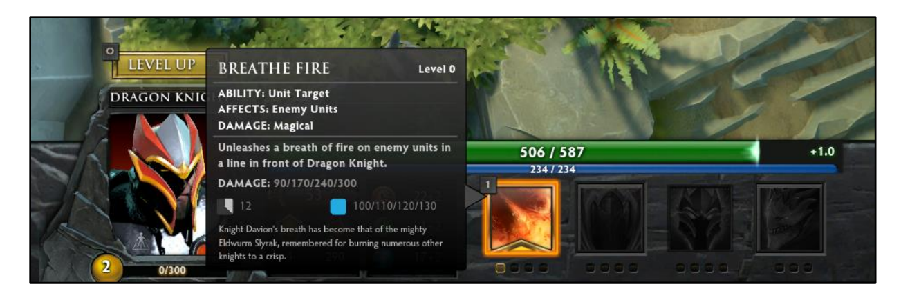
Figure 6. Tool Tip. A "tool tip" which displays additional statistical and "flavor" information about a skill

This information includes detailed numerical data about their armor or damage abilities and more. Here, the game is providing information to the player "just-in-case" [ Timing Principle ]. A new player doesn't necessarily need to know the formula for their armor rating at this point in the tutorial, nor might they yet understand a string of numbers next to a blue square, but they have the option of looking at it more closely if they choose. In fact, the game does not overtly state at this point that players can get these "tool tips," though it is often a convention of the genre, and it can easily be "accidently" discovered during the course of navigating the interface. This kind of information, however, can be a crucial component of expert playing and deep knowledge of the game system, so the game is providing an early on-ramp for this deeper learning—if the player so chooses [Where To Next Principle ].