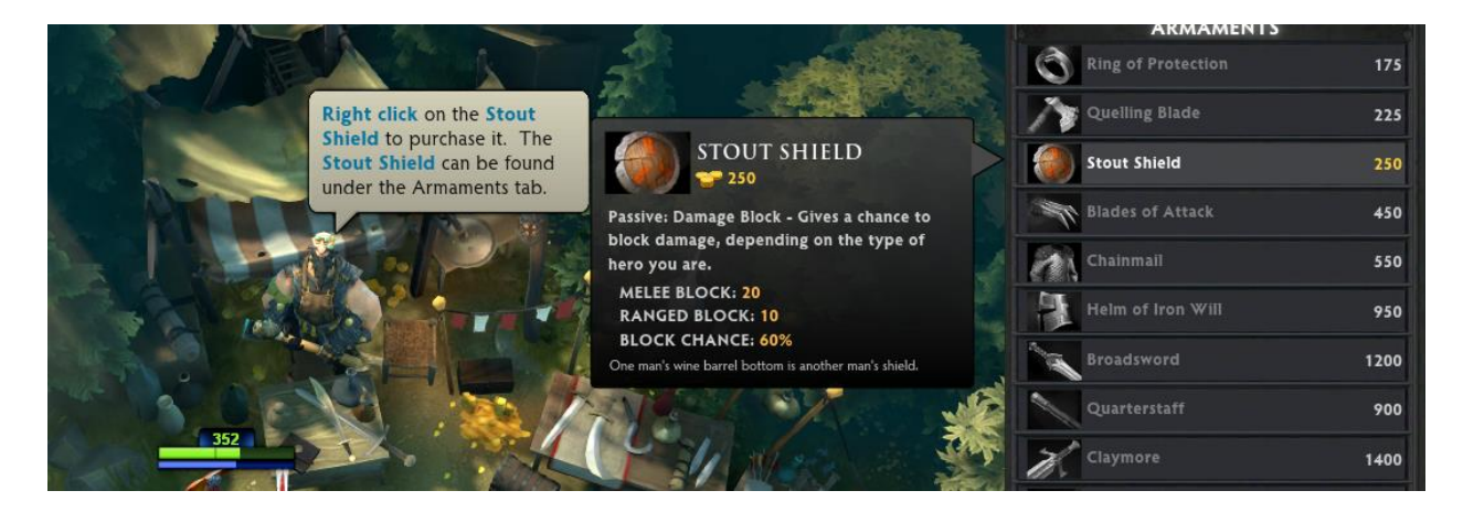
Figure 7. Merchant Screen. Note the only "actionable" item (the Stout Shield) is highlighted while all other items are greyed out; players cannot use these items and the interface effectively disables/backgrounds them.

shopkeeper's inventory while all the other items are "greyed out," so that the player focuses on the right item and can ignore the others; see Figure 4.7).