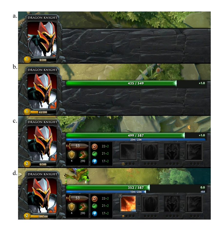
Figure 5. Ability/action Bar Progression. The ability/action bar on the player interface grows as players progress through the module and new information becomes relevant: a) at the outset of the module when the player has no abilities very little information is displayed; b) when the player encounters combat for the first time the health bar appears; c) once the player levels up and gains new abilities the action bar slots appear and hover/tool tips are available (see also Figure 4.6); d) the player adds abilities as they level and "complete" the action bar.

The appearance of the new skills on the action bar also includes a small box next