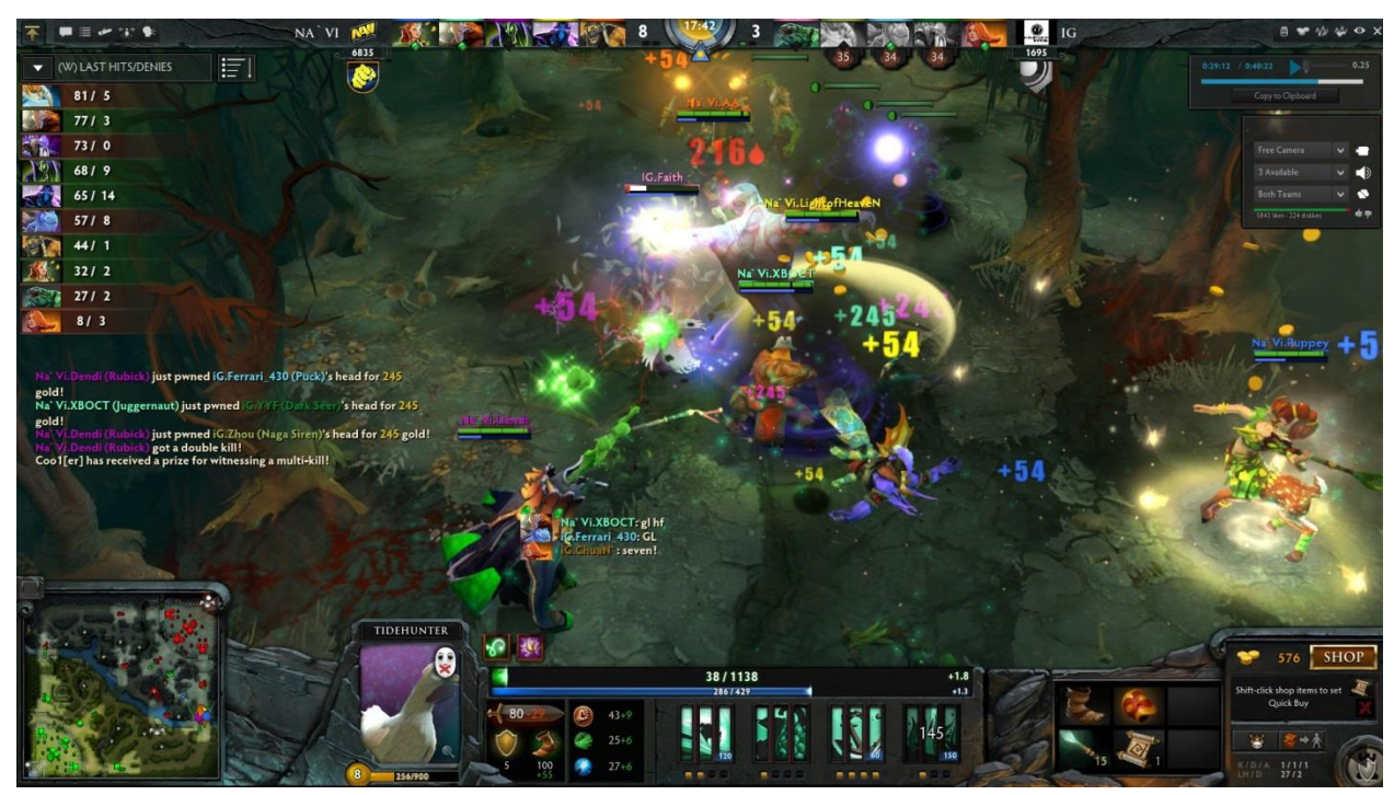
Figure 1. Combat in Dota 2. A typical screen during combat in Dota 2. The screen shows a great deal of information including player health and status, abilities, numerical information about their character, inventory, a map of the overall playing field including positions of allies and enemies, the playing field, statistical information, a chat feature and much more. This screen is animated and constantly changing, though elements of the interface stay relatively static.

which they can use to upgrade their character's abilities and purchase equipment, respectively. There are many different strategies possible in each match depending on the composition of each team and their plan of attack ("rushing" the opponent with all 5 heroes, fighting a battle of attrition, playing "hit-and-run," and so on).