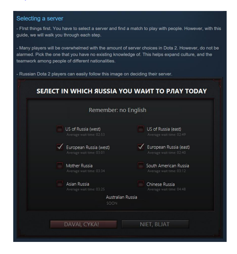
Figure 9. Part of the "How to be a Russian Dota player" guide - note several instances of "trolling" behavior, like the reminder to not use English, or that Russia is "located" on every continent

(http://steamcommunity.com/sharedfiles/filedetails/?id=196964525).