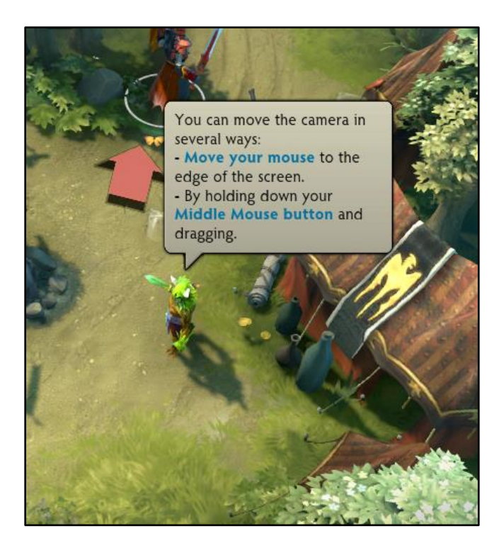
Figure 3. Camera Strategies. The game provides several different strategies for moving the camera (moving the mouse or using the middle mouse button)

Players are then tasked with defeating a single creep (a new problem to face and a new skill to utilize). Once they have defeated that creep (relatively easily), they confront two more. These two creeps also die relatively easily, while the player has gotten additional exposure to the mechanics of combat [Opportunities for Deliberate Practice Principle] . They face one more creep before leveling up (after moving a fair distance across the map, since they have already proven competent at movement). After leveling up, they have earned a new skill (that they manage by using a new portion of the interface), which is then tested by facing three more creeps. It is easiest to defeat these creeps by using the new skill, so the fight is practice in (and a test of) using the new skill