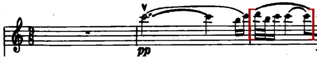
Example 3. b) Babajanian A. Piano trio: Movement 2, mm. 1-3. 147