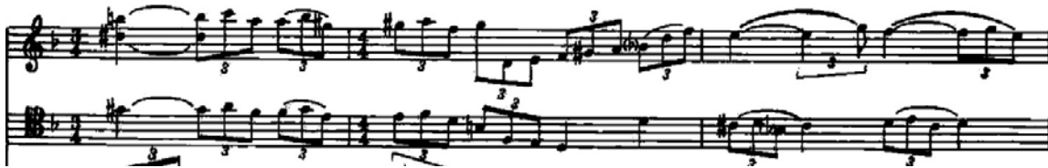
Example 8 d). Babajanian A. Piano Trio: Movement 1, mm. 76-78. 159

Babajanian's use of frequent accents in the piano part, an extended crescendo resulting in fortissimo in m. 46 and stretto in m. 49 to create a strong motion to the arrival and culmination of the movement.