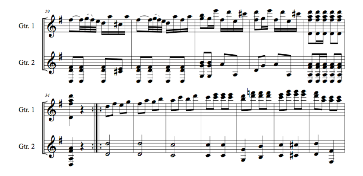
Figure 17. Soler, Sonata 50, mm. 29-41, Guitar Version.