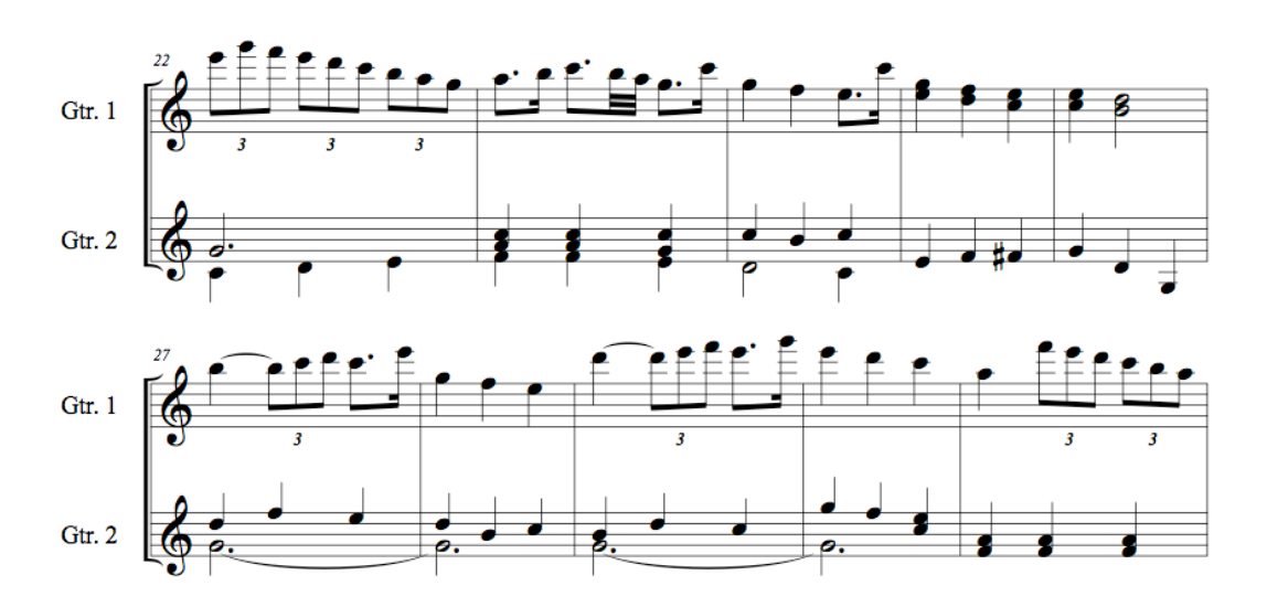
Figure 7. Soler, Sonata 114, mm. 22-31, Guitar Version.

the evolution of the Sonata form in the Classical period, as music became more homophonic and simplified in nature.<sup>57</sup> Sonata 114 is distinctive because of diverse rhythms in the melodic line that change between duple and triple groupings, and dotted rhythms throughout the piece. One of the examples of this continuously-changing writing is found in mm. 22-29, where Soler alternates between the triple and dotted duple meter, as shown in Figure 7. Brown discusses this style of writing, and cites several examples of composers contemporary with Soler intending for the rhythms to be aligned.<sup>58</sup> There are not places in Sonata 114 where Soler writes a triple meter over a duple meter; instead, Soler seems to focus these changes on the melodic line, with a simple chordal accompaniment.