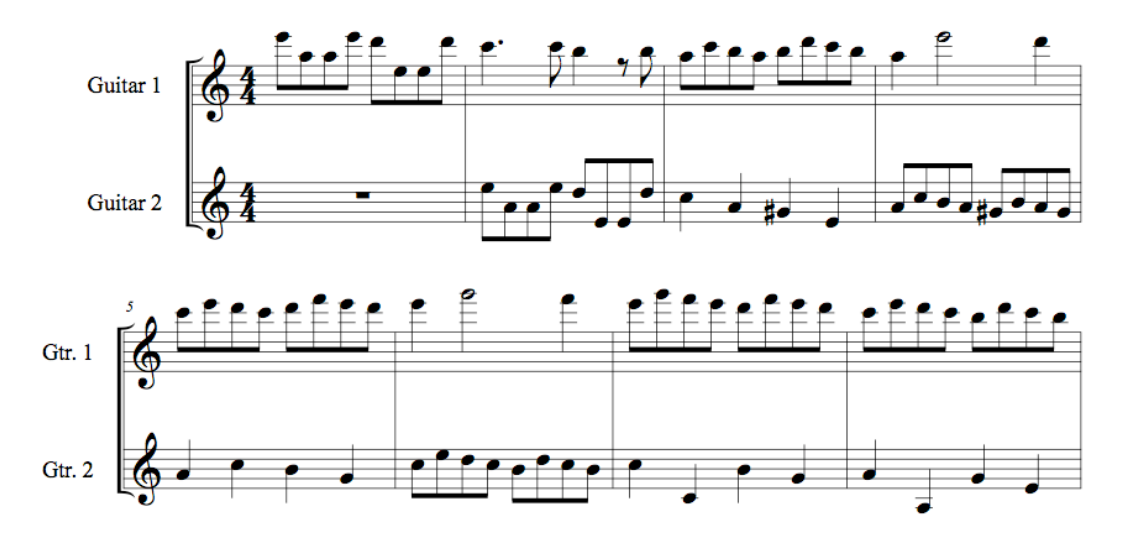
Figure 5. Soler, Sonata 106, mm. 1-8, Guitar Version.

Sonata 106 starts with imitation that, while not influenced directly by guitar, could be immediately realized in an arrangement for two guitars, as shown in Figure 5.