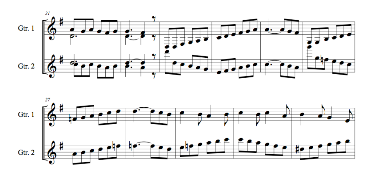
Figure 11. Soler, Sonata 60b , mm. 21-31.

The other theme comprises running scales in each hand, moving in contrary motion to the limits of the instrument. This procedure results in a theme that is effective both visually and aurally (Figure 11).