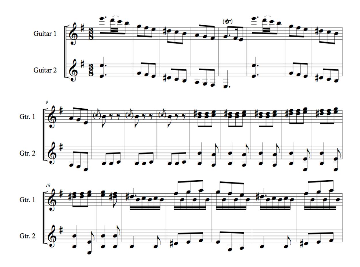
Figure 12. Soler, Sonata 48, mm. 1-24, Guitar Version.

9, 35-39, and 43-53, the entire left-hand part of the first half in Soler's original are in octaves. The guitar arrangement retains as many as possible; however, most are changed to a single note (Figure 12).