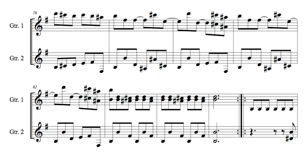
Figure 19. Soler, Sonata 60b, mm. 78-86, Guitar Version.

In other places where notes could not be re-voiced, substituting another chord tone was an alternative solution. For example, in Sonata 106, the unisons that Soler wrote in m. 30 and 33 are difficult as written for the left hand on the guitar. Substituting the second A for an E in this section provides a much easier realization on the guitar, while keeping the same A-minor tonality (Figure 20).