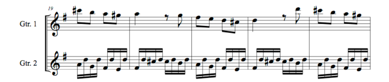
Figure 2. Soler, Sonata 50 , mm. 19-23, Guitar Version.

The chords at the end of each half of Sonata 50 both sound and feel like chords strummed on the guitar in the rasgueado style. In 1674, Gaspar Sanz described two types of guitar music in Spain: the punteado (plucked) style and the rasgueado (strummed) style.<sup>52</sup> The chords that close each half of Sonata 50 point to the rasgueado style commonly used by guitarists.