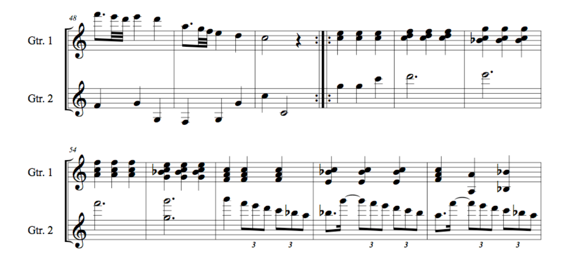
Figure 8. Soler, Sonata 114, mm. 48-58.

The chordal accompaniment starting in m. 51 features chord shapes that are played with ease on the keyboard and are not typically found in guitar music; the texture adds considerably to the accompaniment. Therefore, all of the chords were transcribed without alteration (Figure 8).