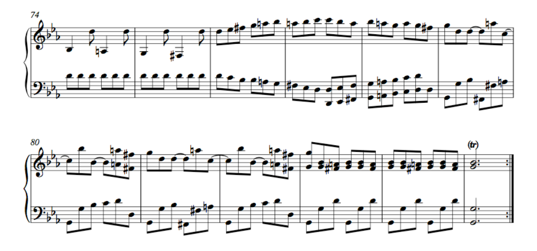
Figure 18. Soler, Sonata 60a, mm. 74-85, Keyboard Version.