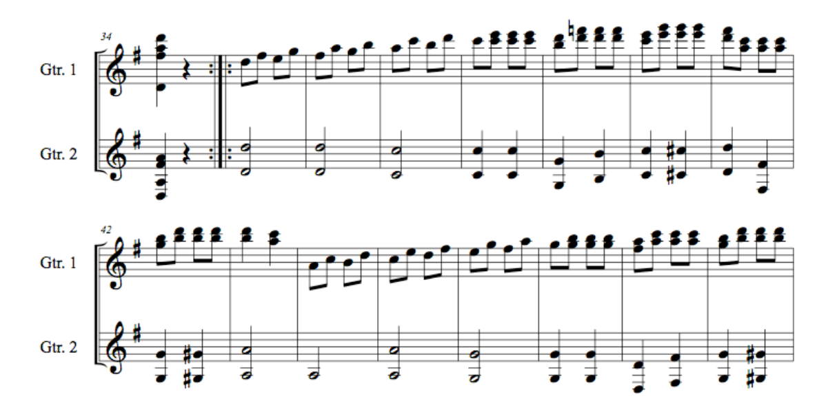
Figure 15. Soler, Sonata 50, mm. 34-49, Guitar Version.

An important element of the present study is to identify influences of Spanish folk music on Soler's writing, and another example of this influence can be found in the