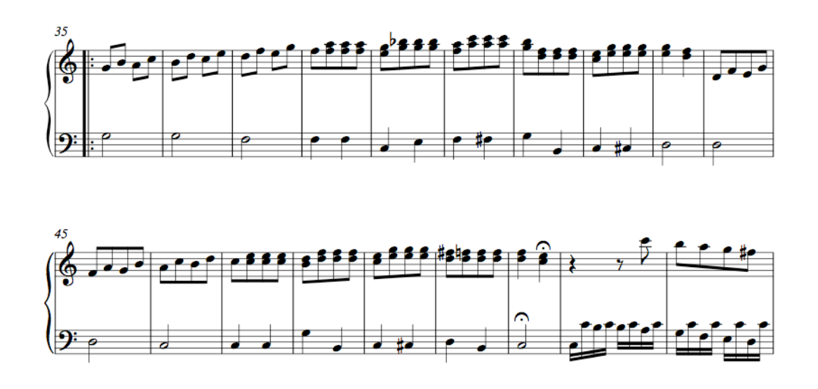
Figure 14. Soler, Sonata 50, mm. 35-53, Keyboard Version.