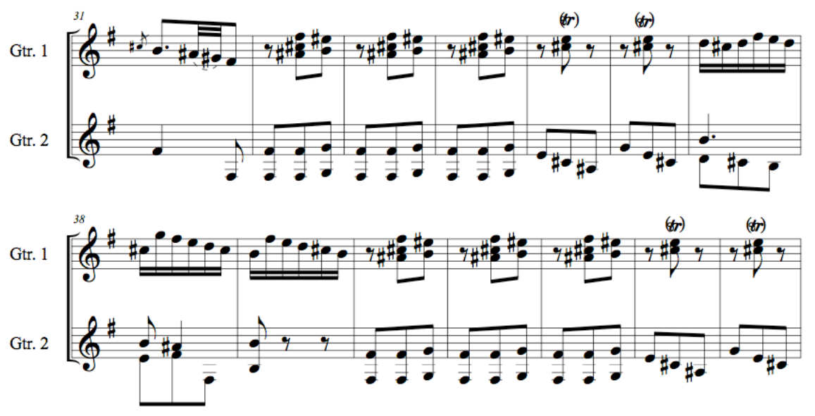
Figure 4. Soler, Sonata 48, mm. 31-44, Guitar Version.