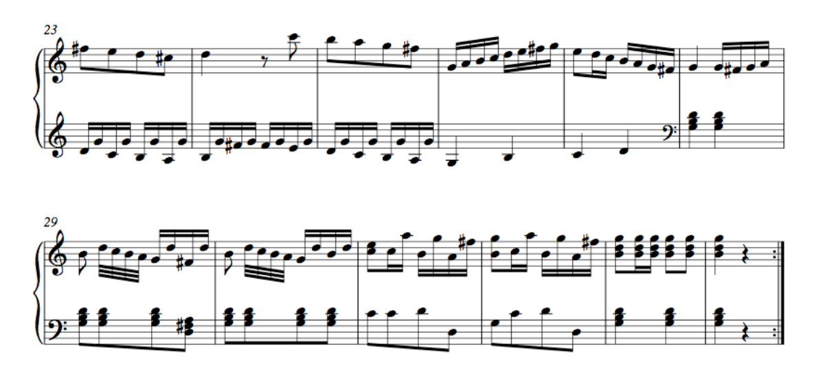
Figure 16. Soler, Sonata 50, mm. 23-34, Keyboard Version.

texture of his chords. A good example of this is the way Soler ends each half of Sonata 50, as shown in Figure 16.