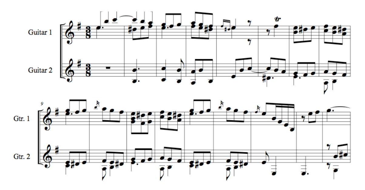
Figure 9. Soler, Sonata 60a, mm. 1-17.

prolific flow of lyrical melodies and the unmistakably Spanish idiom of its numerous ideas."<sup>59</sup>