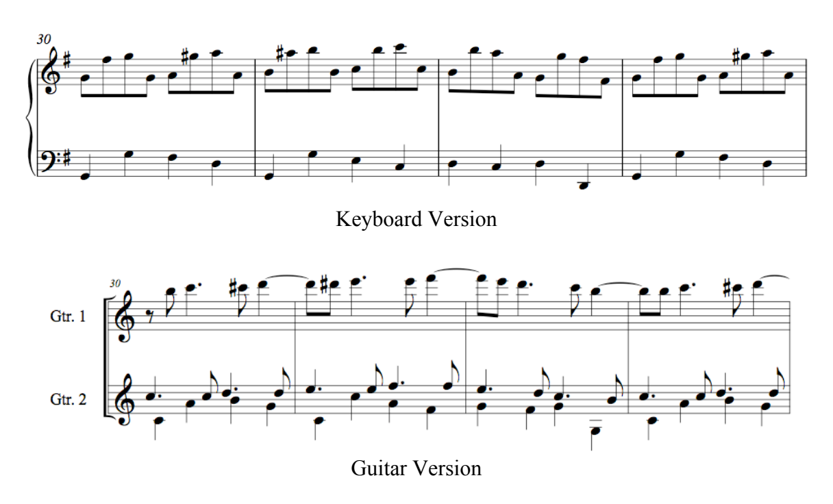
Figure 20. Soler, Sonata 106 , mm. 30-33.