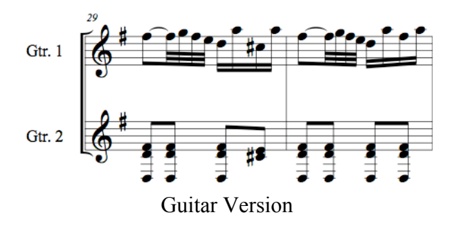
Figure 21. Soler, Sonata 50 , mm 29-30.