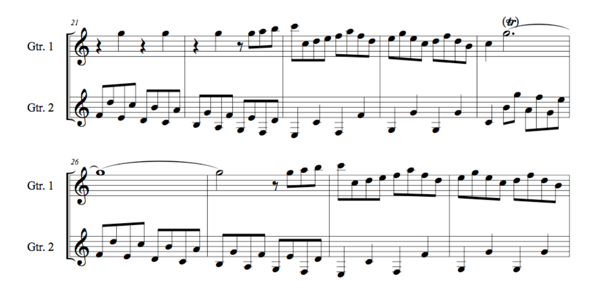
Figure 6. Soler, Sonata 106, mm. 21-29, Guitar Version.

Soler uses thematic material later in Sonata 106 that is idiomatic to the guitar, such as the run of 6ths in mm. 20-27 and 65-72 (Figure 6). This sonata is similar in style and texture to the two-part inventions by J. S. Bach, and possibly was composed as a didactic work for one of Soler's young students at El Escorial.