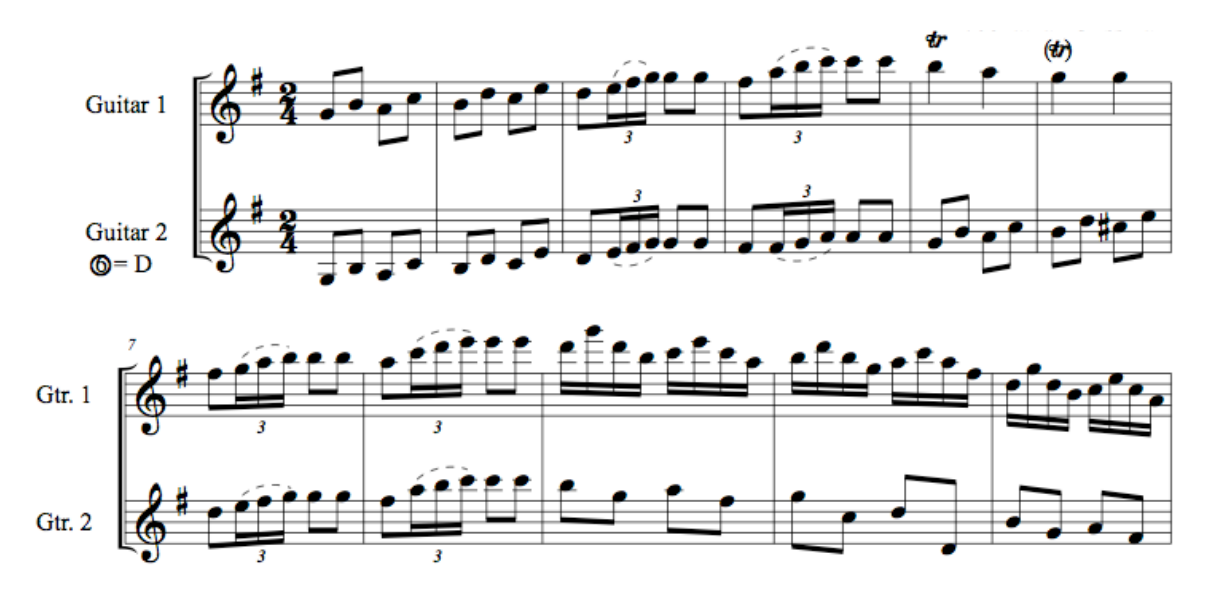
Figure 1. Soler, Sonata 50, mm. 1-11, Guitar Version.

alone. This technique was (and still is) part of performance practice for guitarists, and a stylistic feature that Soler wanted to imitate.<sup>50</sup>