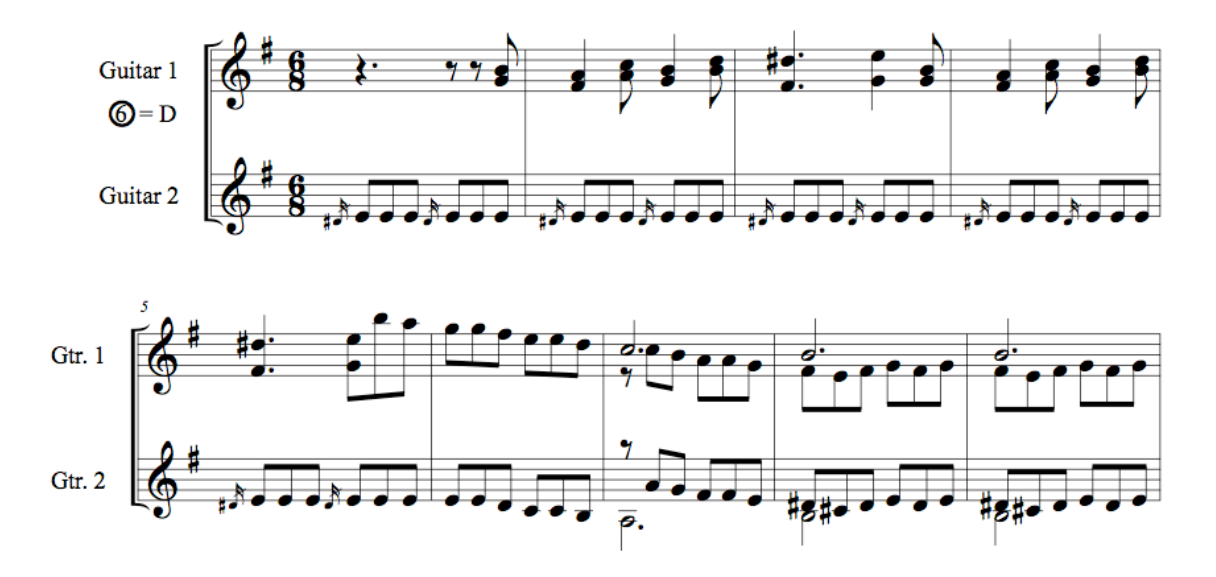
Figure 10. Soler, Sonata 60b, mm. 1-9, Guitar Version.

The other theme comprises running scales in each hand, moving in contrary motion to the limits of the instrument. This procedure results in a theme that is effective both visually and aurally (Figure 11).