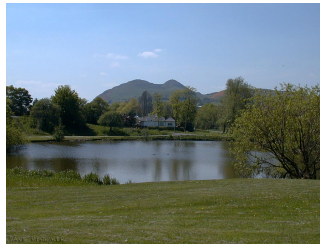
Figure 2. QR Code 2