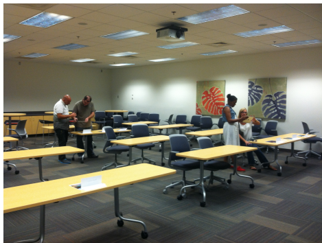
Figure 8. Participants working in pairs in the high AR condition.

equidistantly around the classroom as shown in Figure 8. These participants were allowed to confer to derive an answer for a given question during the learning activity; however, each participant was required to submit his or her responses to the pre- and posttest individually. For the learning activity, images were in the form of 3-D dynamic images and animations made with hand-rendered art and computer-generated objects. The learning activity was interactive and included other instructional text and traditional Apple iPad gesture inputs.