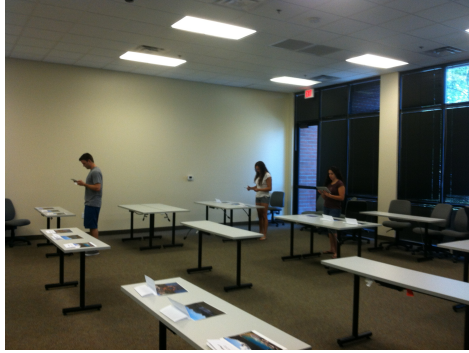
Figure 9. Participants working without collaboration in the high AR condition.

Low AR with collaboration. In this treatment group, participants were randomly assigned a partner to work with to complete the learning activity. However, while sharing a mobile device, each pair was positioned at one stationary location to complete the learning activity as shown in Figure 10. These participants could confer to derive an answer for a given question during the learning activity; however, each participant was required to submit his or her pre- and posttest responses individually. For the learning activity, the images were in the form of 3-D dynamic images and animations made with hand-rendered art and computer-generated objects. The learning activity was interactive and included other instructional text and Apple iPad gesture inputs.