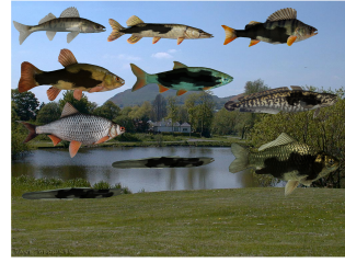
Figure 4. Non-AR Image 1 Figure 5. Non-AR Image 2 Figure 6. Non-AR Image 3

In either case, the content in the learning activity was exactly the same between all treatment groups (AR or no AR). The goal for each treatment group was also exactly the same; only the delivery method varied as described in the following section. The learning activity took on average 30 minutes to complete. It was designed to help learners understand proportions and sampling variability given a particular learning narrative. The learning activity covered statistical topics such as populations, samples, and what it means for a sample to be representative of the population. By analyzing fish of different color, participants analyzed varying samples and identified factors affecting sampling variability. The overall learning goal of the scenarios was to increase the statistical reasoning skills of the participants. Specifically, the learning objectives for the activity were: