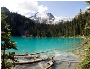
Figure 1. QR Code 1

version of the learning activity. The AR experience leveraged three QR codes for the tracking and rendering of the various images of fish, gaining the camera perspective for correct augmentation of color and other visual hints. In the context of the fish theme, the QR codes were depicted as a body of water, as shown in Figures 1, 2, and 3. The QR codes were designed to resemble one of the three areas of a bay to support the water life theme of the narrative of the learning task.