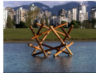
Figure 3. QR Code 3

Mobile device. Apple iPad tablets running iOS 5 or later with built-in cameras (generation 2 or 3) were used for the treatment groups with AR (high AR and low AR). A custom software application was installed on each tablet prior to running the study to permit the participants to view the content in 3-D. Participants interacted with the 3-D images by aiming the tablet at each QR code. The tablets were wirelessly connected to the Internet so that corresponding questions could be queried from a remote database. Also, a wireless solution permitted multiple participants to launch the mobile AR learning activity and move around the classroom at the same time without the need for cables.