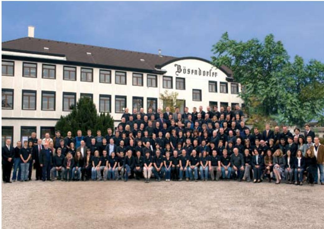
Your Bösendorfer Team from Vienna, Austria

We wish you Good Luck and a lot of Success