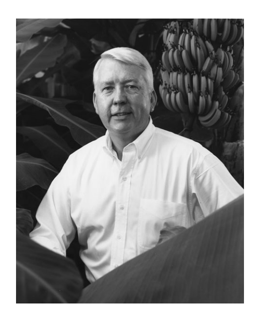
Figure 2 In the 1990s, we expressed antigens in multiple crop species with a goal of creating a minimally processed oral vaccine. The concept of using banana fruit attracted extensive interest in the press, although the low expression of antigen in the fruit, and the 3 + year cycle needed to create a transgenic fruiting plant caused us to abandon this area of research. (Photograph from the Boyce Thompson Institute files, 1999).