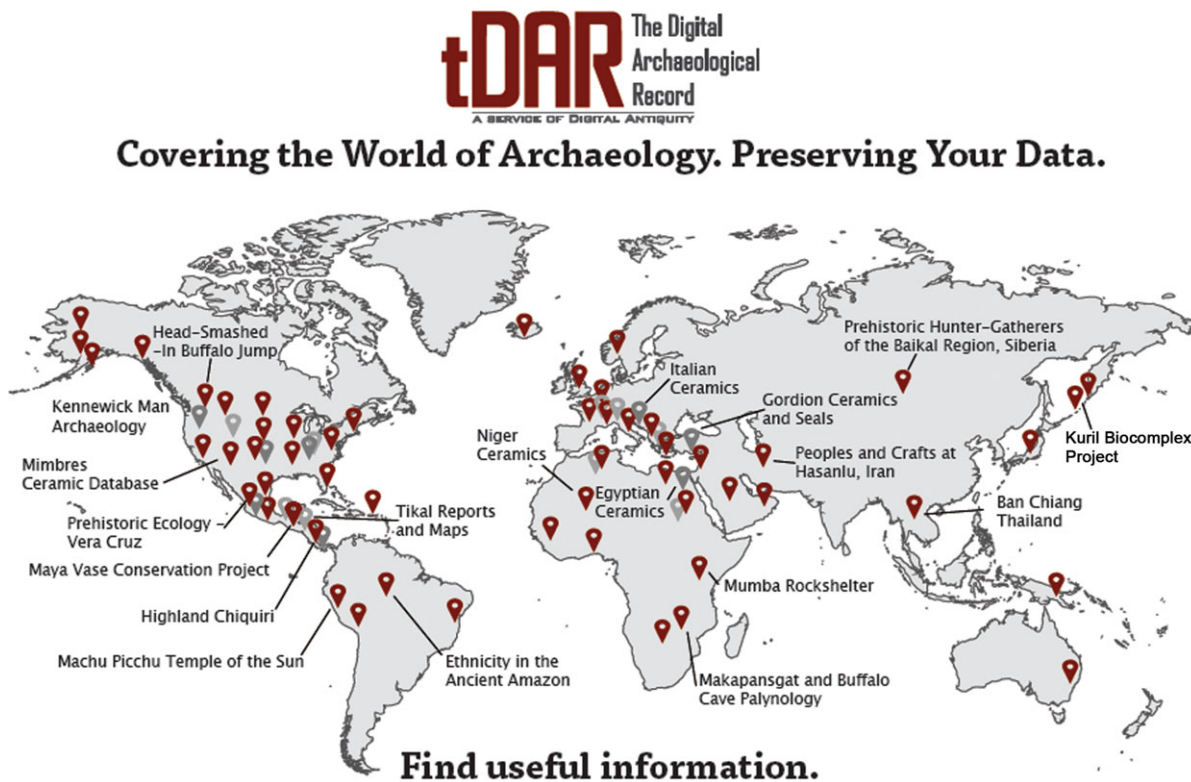
FIGURE 3. Schematic view of global contents of tDAR showing some examples.

worked with the Maryland Archaeological Conservation Laboratory and Fort Lee Regional Repository to establish an archive in tDAR for digital files from 17 military facilities for which these two repositories curate physical collections and associated paper records (Cofield and Eyre 2014; Department of Defense Legacy Program 2014).