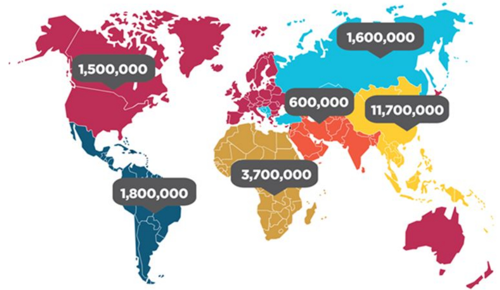
Global Victims of Forced Labor