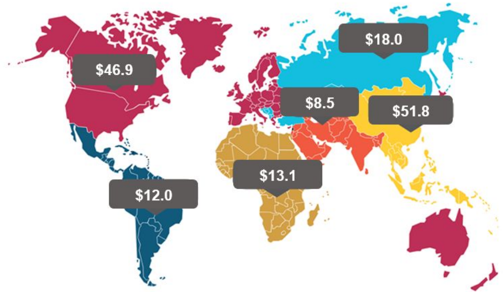
Annual Profits of Forced Labor per Region (US $ Billion)