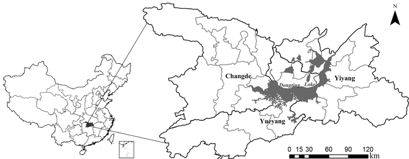
Figure 1. Location of study area, showing Dongting Lake district, China, 2005–2010. doi:10.1371/journal.pone.0106839.g001

obtained from HFRS data and environmental variables iterated 10 times in this study. Then the maximum probability occurrence model was calibrated based on the background data.