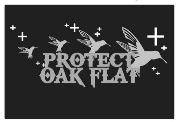
Figure 2. Screenshot of Apache Stronghold's first Twitter post from April 20, 2015. The post is a combination of four hashtags and an image macro (i.e. meme). The image macro depicts four hummingbirds, cross symbols, and the text "PROTECT OAK FLAT".

Text posts are generally more informative in nature to disseminate statements, press releases, information about Congressional efforts, challenging claims that minimise the importance of an issue, and may include calls to action. Calls to action could be categorised into the following calls: supporting petitions, calling congressional leaders or local organisations, sharing of posts, fundraising requests, and shows of solidarity. Table 1 lists four examples of Apache Stronghold's social media text-only posts on Facebook and Twitter.