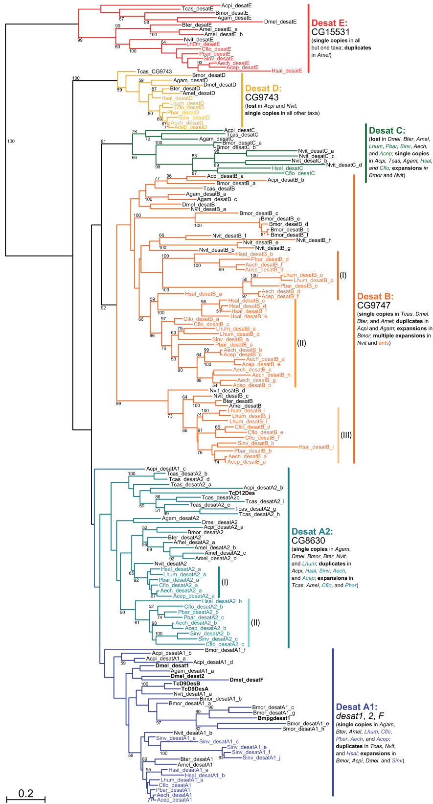
FIG. 1. Reconstruction of the phylogeny of insect First Desaturase genes, illustrating the division of the gene family into six subfamilies. The unrooted maximum-likelihood tree was obtained from 170 genes of 15 species, with confidence values at the edges derived from 1,000 rapid bootstrap replicates. Gene names follow the updated nomenclature proposed in this study, except for genes that have previously been characterized in the literature (in bold). Species are indicated by four-letter prefixes as follows: Aech , Acromyrmex echinator ; Acep , Atta cephalotes ; Cflo , Camponotus floridanus ; Hsal , Harpegnathos saltator ; Lhum , Linepithema humile ; Pbar , Pogonomyrmex barbatus ; Sinv , Solenopsis invicta (all ants, in color); Acpi , Acyrtosiphon pisum ; Amel , Apis mellifera ; Agam , Anopheles gambiae ; Bmor , Bombyx mori ; Bter , Bombus terrestris ; Dmel , Drosophila melanogaster ; Nvit , Nasonia vitripennis ; and Tcas , Tribolium castaneum .