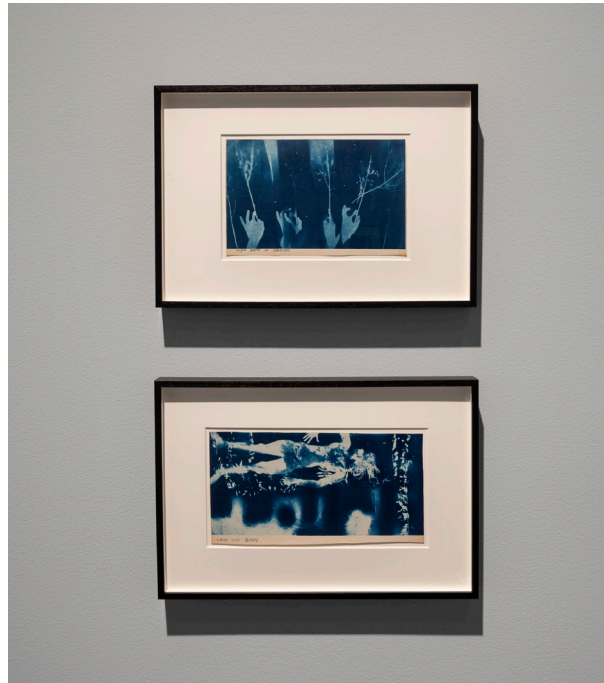
Fig.4 Paul Hester, Installation image, “Photography and the Surreal Imagination,” Digital Image, courtesy The Menil Collection, 2020

are foreboding. Hamilton cultivates a sense of the uncanny through the body’s unresolved relationship to the landscape, suggesting the racial injustice upon which the infrastructure of the South was formed, and continues to ferment.