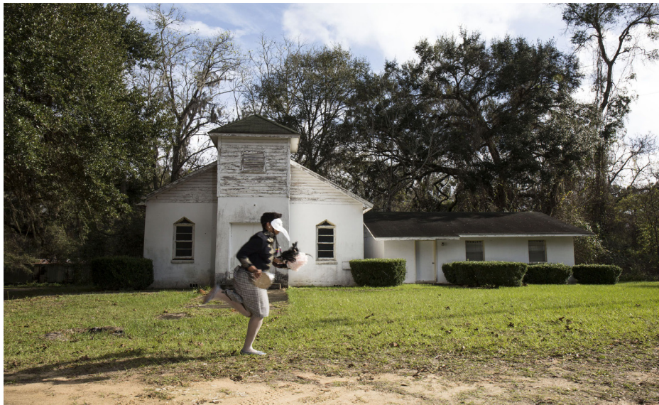
Fig. 2. Allison Janae Hamilton, Scratching at the wrong side of firmament , 2015, Archival pigment print 24 x 36 inches (61 x 91.4 cm)