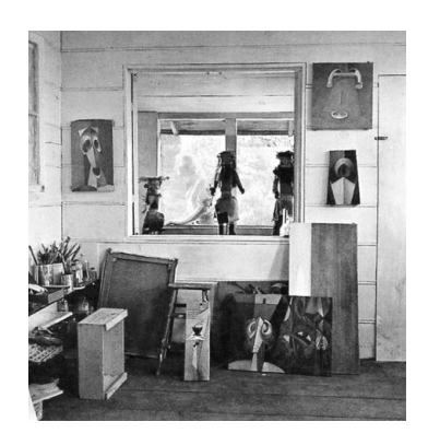
Fig. 3. Max Ernst, Interior of Ernst/Tanning House with dolls, Capricorn Hill, Sedona, 1946

juxtaposed with his own small and large friezes and an additional "mask frieze." Photos of the interior of his Sedona house show a careful installation of the katsinas and other artifacts, positioned next to the artists' paintings (Fig. 3). Their pattern of display both on the interior and exterior walls of the house consistently juxtapose Ernst's collection with his and Tanning's own works. This generally follows the style of display that Breton used in his apartment.<sup>11</sup>