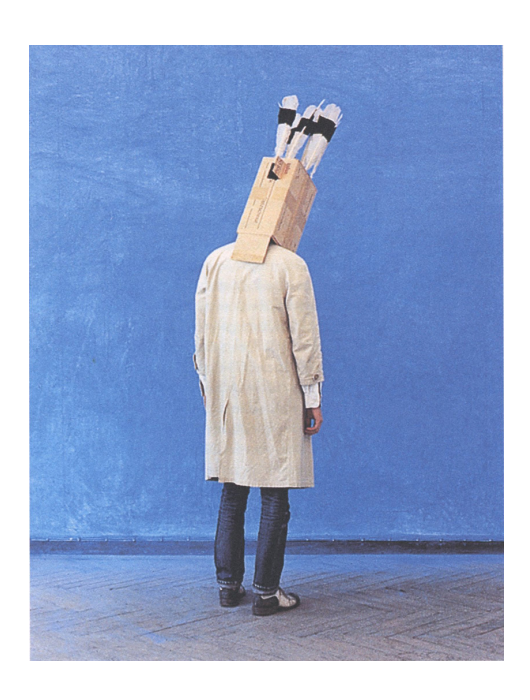
Fig. 6. Lothar Baumgarten, Makunaima , 1972 © 2013 Artists Rights Society (ARS), New York / VG Bild-Kunst, Bonn

to negotiate with them what people must do to rectify things like bad weather. A shaman is initiated to this service through a particular process. This occurs in dreams and visions, and often coincides with experiencing a grave illness and falling into a coma, which compel the shaman-initiate to go off into the wilderness, where he imagines being taken to the house of the spirits. The spirits often kill the initiate, whereupon he is then restored to life and wholeness. The sprits then give the gift of a substance or magic object that is added to the shaman's body, like a quartz crystal, or, in Beuys' version, the materials felt and "fat," which feature so prominently in his art. This gift is a token of the shaman's newly possessed powers, and which he can continue to access. In North America the helpers of the shaman are often animal spirits, and the shaman mimics their cries and movements in a dance. He uses music to summon these divine helpers and enter a trance that begins his journey to the land of the spirits.<sup>26</sup> Beuys was careful to construct his "story," or his personal mythology involving his shaman-like resurrection—his alleged rescue from plane crash in the Crimea during World War II by nomadic Tartars (and many actual Tartars practiced shamanism)—around many aspects of the path of the shaman I've just summarized. In the three performances of the mid-'60s I've mentioned, Beuys restages the