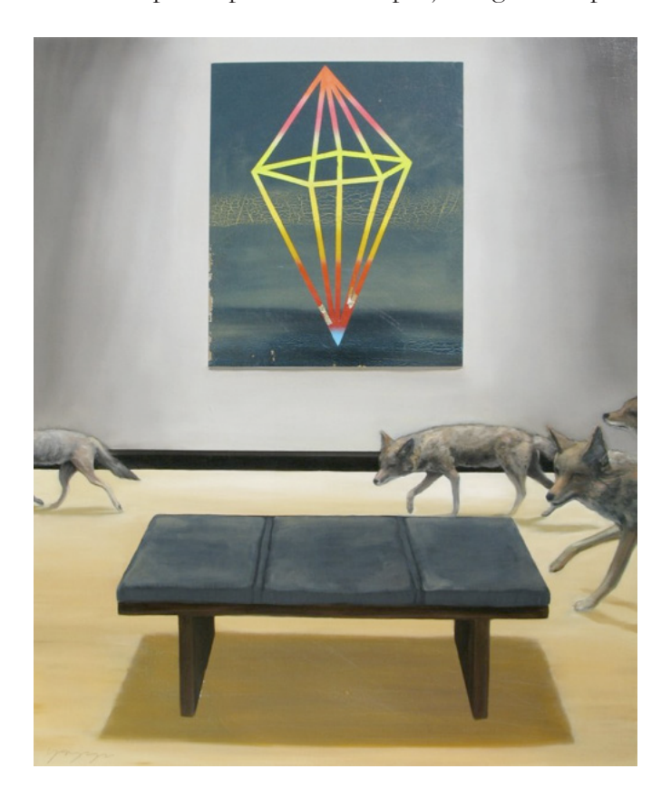
Fig. 8. Steven Yazzie, Death of the Curator, 2009, courtesy of the artist

Perhaps Coyote's deeply political role is another reason why Steven Yazzie has turned to focus on the figure. For him it is a figure that bridges what is usually seen as two distinct and separate processes: the projecting of the prehistoric/