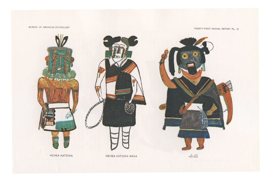
Fig. 5. Sketch of Heheya and other katsinas from Jesse Walter Fewkes, Hopi Katchinas Drawn by Native Artists (Smithsonian Institution, 1903)

These imitative photographic images necessarily relate to other photographs that were for decades considered markers of Native authenticity: those "documents" of the "vanishing race" of Native Americans created by photographers of the American West such as Edward S. Curtis, among others. As Vine Deloria, Jr. has noted, these photographs functioned as "a weapon in the final skirmishes of cultural warfare in which the natives of North America could be properly and finally embedded in their place in the cultural evolutionary incline." <sup>16</sup> Deloria notes that Curtis' picturesque photographs of Indians "suggest a timeless reality in which nobility, integrity, and wisdom flourish and prosper," yet in doing so they put forward such a reality as historical, one that was already past—as Deloria puts it, "the history we would have liked to have possessed." The imitative photographs of European anthropologists and artists posing as Indians, on the other hand, ironically suggest a modern Indian culture of the present, one that, in terms of the images that define it, has literally been taken over by Europeans. 17 In other words, when photography put forward images of modern Indians, they were largely only those who were embodied by European mimicry, or, performed by European imitators of indigenous people.