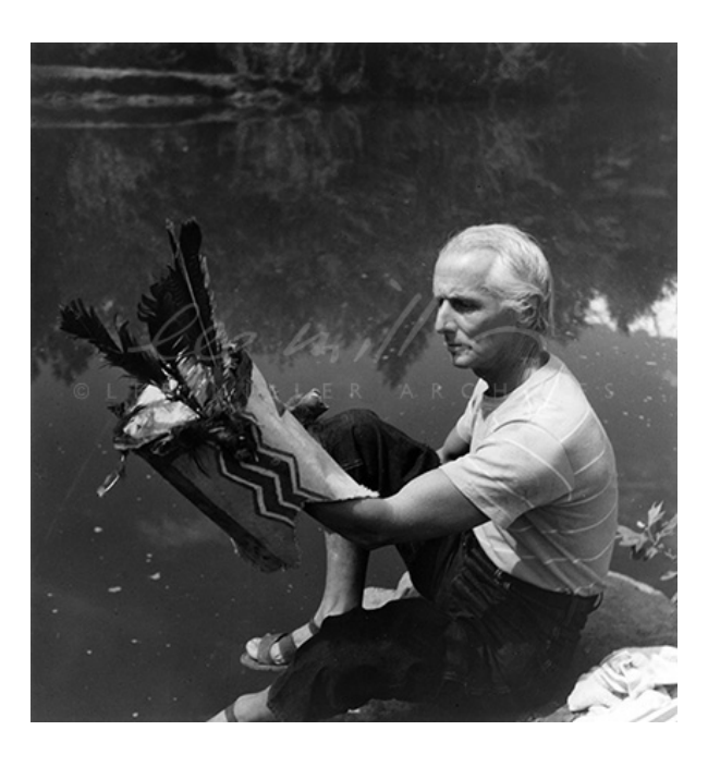
Fig. 4. Lee Miller, Max Ernst at Oak Creek, Sedona, Arizona, 1946

A close viewing of the mask Ernst wears indicates that it does not conform to the customary configuration of a Heheya Katsina. Jesse Walter Fewkes asked a Hopi artist to sketch the Heheya and other katsinas and described the Heheyas as "each with characteristic zigzag symbols on the face and with oblique eyes and mouth"15 (Fig. 5). The incorrectly placed zigzag symbols, the crude eyes, and the strangely curved lower edges of the mask cut to fit onto Ernst's shoulders, suggest that this mask was likely Ernst's own work, an imitation of a mask and of dances he had recently observed on the Hopi mesas. He may have been aware of how sacred such objects were, and as a result, devised a kind of copy for himself that he would be able to use. Ernst consciously performs with this object as a kind of artistic fiction for the camera. It is also of interest that Ernst chose to pose bare-chested while he wore the mask, as he did in his more well-known portrait from this day by Miller. It is as though Ernst understood that his unclothed body, along with his association with these key artifacts, could carry over the authenticity of the Arizona landscape and the cultures it contained to his own persona as an artist. Ernst's positioning in the Arizona landscape was another element of authenticity that would have to be recorded and indexed by the camera.