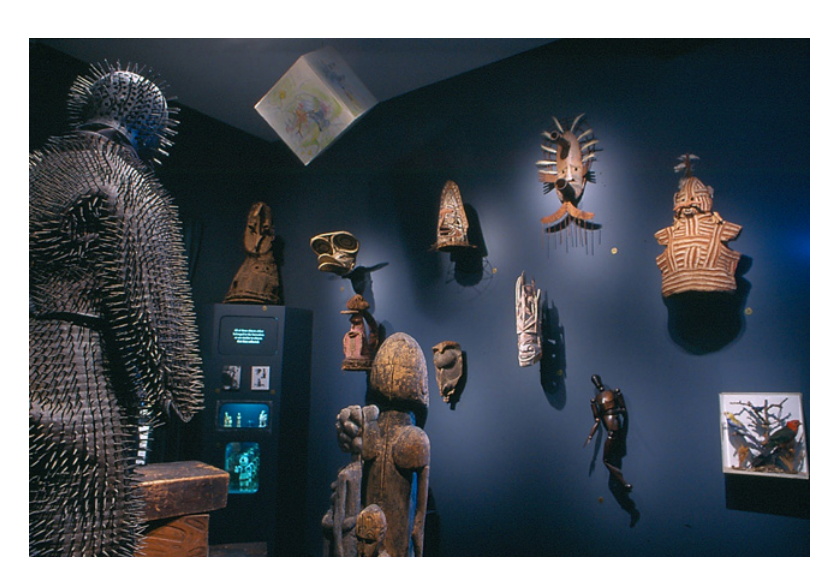
Fig. 5. Witnesses Room, Menil Collection, Corner Cabinet with the inscription: The objects in this exhibition were either owned by the Surrealists or are in the spirit of those they collected. The Menil Collection, Houston.

The room occupies a dark corner of Renzo Piano's tranquil modernist building, created to house the Menil's surrealist-influenced modern collection, and