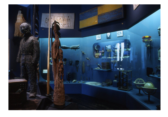
Fig. 7. Witnesses Room, Menil Collection, Vitrine. The duck-rabbit drawing by Joseph Jastrow, referred to by Wittgenstein and Carpenter, as well as a version of Dalí's African village, are inside the vitrine, on the right. The Menil Collection, Houston.

In the Menil's Witnesses Room, Carpenter displays Western visual puns as well, including a reproduction of the photograph of an African village that Dalí tinkered with and published in 1931 with the title Paranoid Face , playing in a characteristically humorous way with the continuities between disparate cultures that interested Breton. Dalí touched up the photograph with white paint and rotated it so that it became transformed into a primitivist head of the type that might have been made by Picasso. The original village and villagers remain identifiable as ghostly