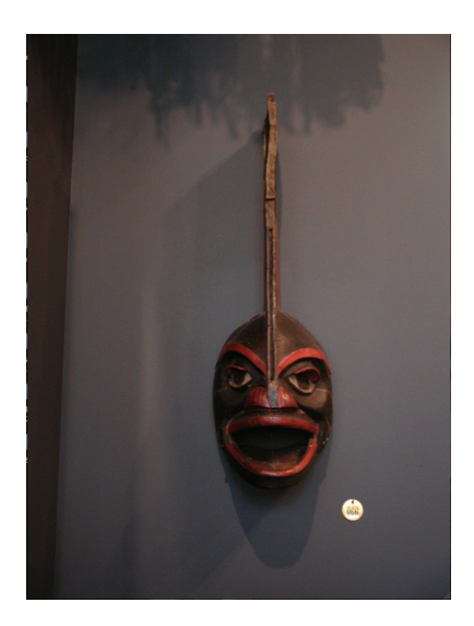
Fig. 6. Witnesses Room, Menil Collection, Mask of a Killer Whale with Dorsal Fin; The Menil Collection, Houston.

One reality is then contained within, and co-exists, with another, in a reversible, non-hierarchical relation of one thing to another, the manifest and the latent, the thing and its ghost. "With a transformation mask you have a change