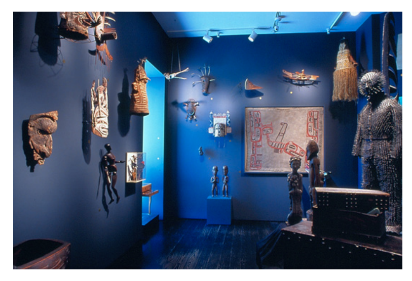
Fig. 1. Witnesses Room, Menil Collection, Back Wall. The Menil Collection, Houston; Photographer: Kent Dorn