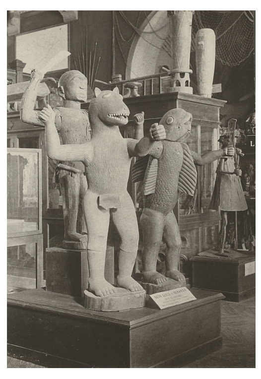
Fig. 3. Trocadero Museum of Ethnography, African Room, 1895.