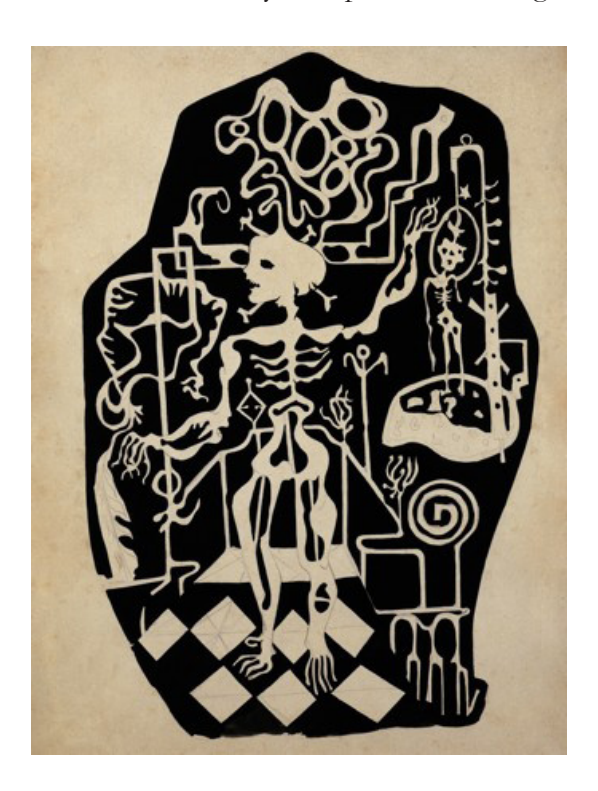
Fig. 5. Juan Batlle Planas, Radiografía paranoica (Paranoid X-ray), 1936, tempera and graphite on paper, 34.6 x 26.5 MALBA-Costantini Collection, Buenos Aires.