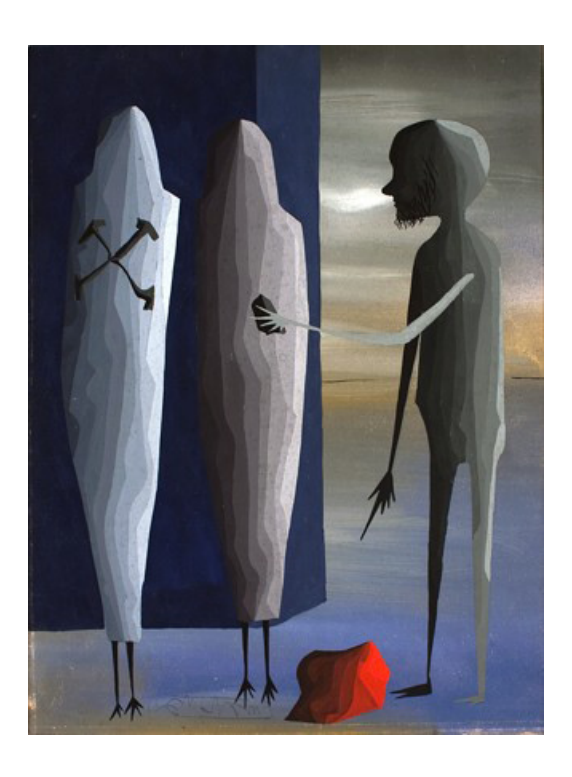
Fig. 8. Juan Batlle Planas, Tres Personajes (Three Characters; alternatively titled The Message), not dated, Blanton Museum of Art, The University of Texas at Austin, Gift of Arte BA Foundation, 2007.

I don't want anyone to look for facets to polish me. It's the only way to maintain feeling like a carbon of 2,000,000 years." Considering that Batlle Planas believed in his own condensed ageless energy, his paintings may be considered versions of orgone accumulators meant to heal and transform those who view them.