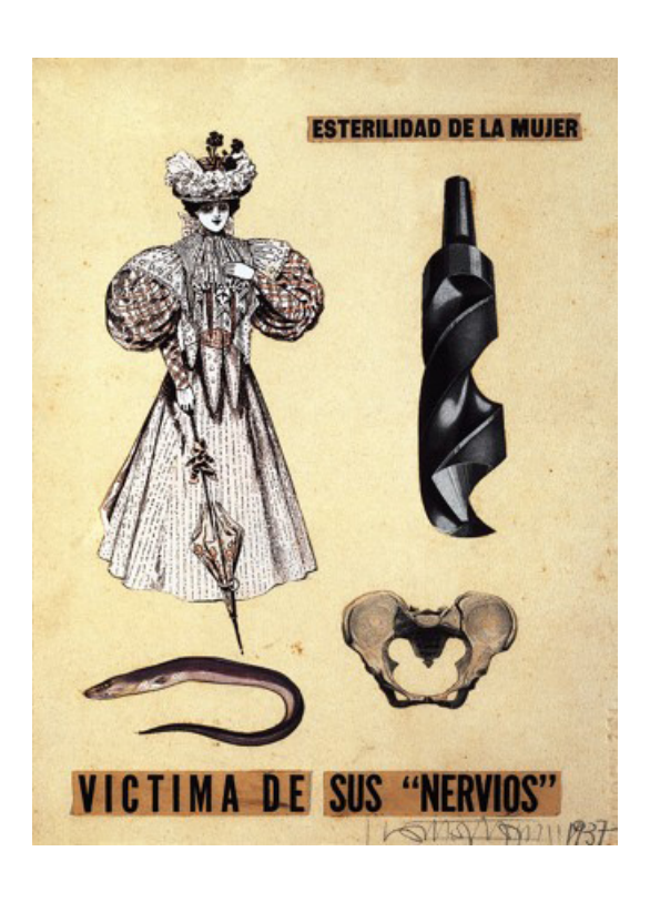
Fig. 4. Juan Batllle Planas, Victima de sus 'nervios' (Victim of his/her/their 'Nerves'), 1937, collage on paper 31.9 x 24.3 cm. MALBA- Constantini Collection, Buenos Aires.

Berni's but also through its film club, inaugurated in 1929 with a season of French surrealist films including Buñuel and Dalí's joint-production, Un chien andalou (1928).