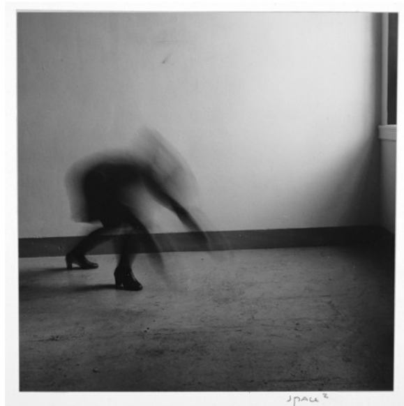
Fig. 3. Francesca Woodman, Space² , Providence, RI (RISD), 1976.

Man Ray was the first Surrealist to explore the slender distinctions between the apparently contradictory worlds of the real and the inexplicable in photography—the most purely surrealist medium according to Krauss, because of its ability to capture the “automatic writing of the world.” 36 Man Ray’s timing, framing, and cropping made of straight photography a window onto another world, blending the double reality of everyday consciousness and dream according to the Bretonian notion of surreality : “the future resolution of these two states, dream and reality.” 37 Woodman works towards a comparable effect when her own body becomes ghostlike, strangely insubstantial and partially disembodied, blurring the boundaries between the human body and her setting, as in her House series. She seems to be