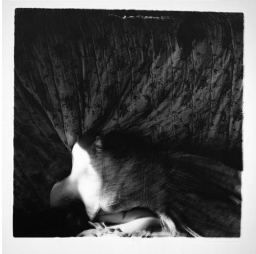
Fig. 5. Francesca Woodman, Providence, RI (RISD), 1975-1978.

“diary pictures,” certainly seem to tell as much as show—a story that seems familiar, involving fairy-tale or gothic transformations. 40 She could be asking herself Breton’s follow-up to his opening salvo “Who am I?”: what or “whom [do] I ‘haunt?’” And yet the words with which to complete the narrative seem just beyond reach, comparable to the way Woodman’s body seems to be moving just beyond visibility.