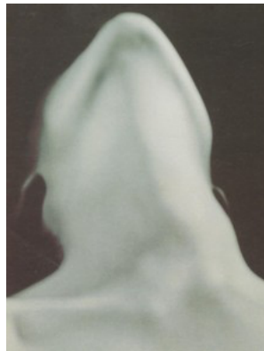
Fig. 4. Man Ray, Anatomies , 1929 © 2008 Man Ray Trust / Artist Rights Society (ARS), NY / ADAGP, Paris

The haptic quality evoked by Krauss in her writings on surrealist photography is captured by Woodman through her use of black and white and the sensual plethora of grays rendering her textures almost three dimensional. “You have to feel the contact of the surfaces and objects photographed with bare skin,” writes Rankin. “I know because I found myself more than once covered in flour or some other substance.” 39 This direct physicality comes close to the way Foucault describes automatic writing for Breton. Woodman’s series, what one friend calls her