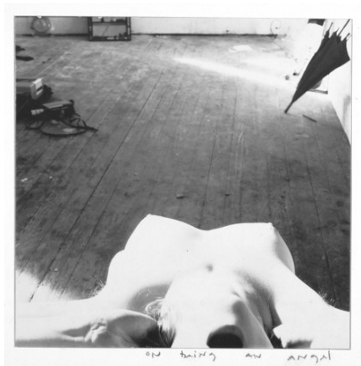
Fig. 7. Francesca Woodman, On Being an Angel , Providence, Rhode Island, 1977.