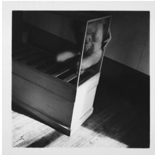
Fig. 6. Francesca Woodman, Space 2 , Providence, Rhode Island, 1976.