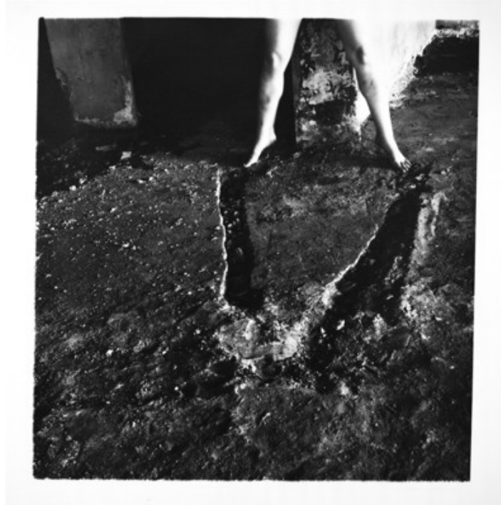
Fig. 9. Francesca Woodman, from Angel Series , Italy, 1977-78.

This surrealistic slippage between what is alive and what is not, between what we are seeing and what we are only imagining, dominates the second Space 2 sequence, of a nude woman crouched in a glass vitrine. For Woodman, “the idea of the display case as a container to be looked into” functions as a way of showing “the idea of a contained force trying to be freed,” as she explains in her journal. 50 A woman’s