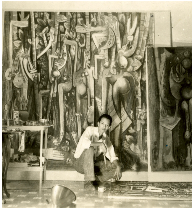
Fig.6. Artist Portrait of Wifredo Lam in front of La Jungle, VVV 2-3 (1943)