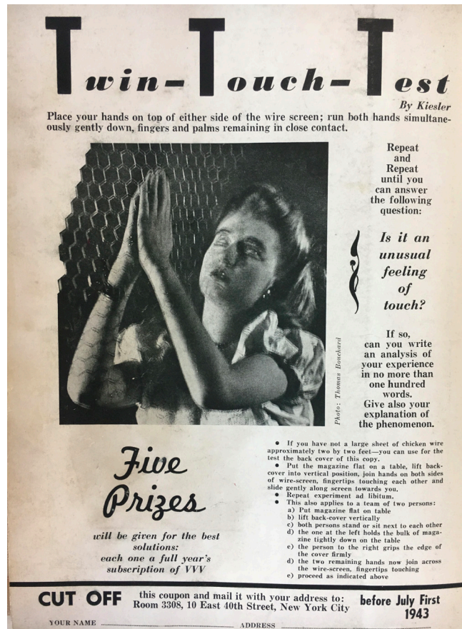
Fig. 1. Frederick Kiesler, Twin Touch Test, VVV 2-3 (1943)

who also designed Peggy Guggenheim's "Art of this Century Gallery." The back cover of VVV 's double number (no. 2-3, 1943) includes a cut-out over which a wire is spanned. Kiesler calls this object "Wire Screen" and explains on the issue's last page how to handle it by inviting readers to participate in a Twin-Touch-Test (Fig. 1):