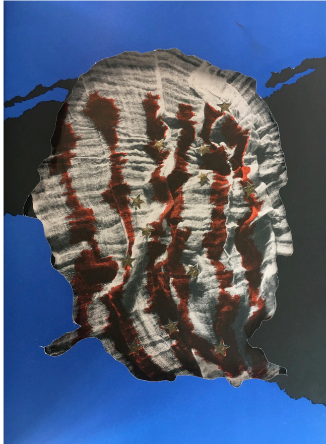
Fig.3. Marcel Duchamp, Genre Allegory , “George Washington’s head,” VVV 4 (1944)

of the work is indicated. The structure of the paper draws wavy lines and stars on the white page and thus transforms Genre Allegory into yet another artwork. Again, readers must look ahead, look beyond the first page, to discover that their initial perception has been undermined. But they will also discover new appearances and creations. Duchamp’s contribution to VVV thus turns the simple activity of reading into a surrealist strategy of transgression that questions reality’s reliability—because the readers will find out that there is always more to discover.