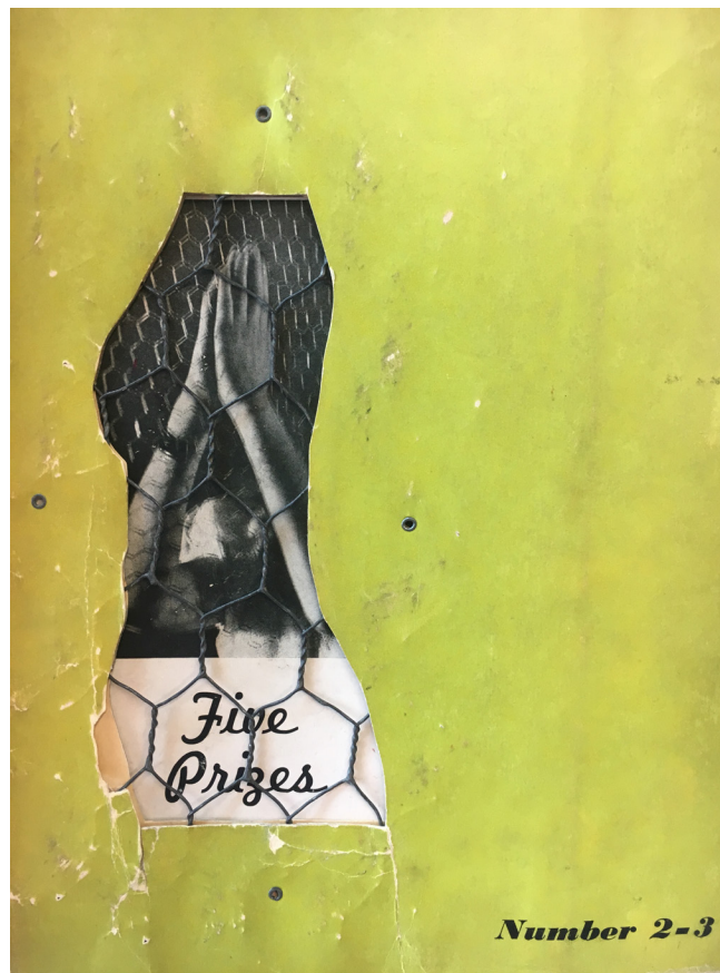
Fig. 2. Frederick Kiesler, Twin Touch Test, “The Wire Screen,” VVV 2-3 (1943)

considering its materiality, it appears to be a broken image of American nationality, since the red stripes seem to be soaked with blood. By pairing this image with George Washington’s head, Duchamp subverts national icons and alludes to the dark and violent side of American history, especially with regard to slavery. Genre Allegory was originally designed as a cover for Vogue , where it was rejected because “Duchamp’s version of the stars and stripes was too reminiscent of a blood-stained bandage.” 16 As in the case of Kiesler’s “Wire Screen,” a visual strategy of confusion is achieved in Genre Allegory not only by the cut-out that couples the image of George Washington with that of the American flag, 17 but also by the manipulation of the page. It is by turning the page and touching the print of the iodine-stained cloth that the reader gets the whole picture of Genre Allegory : she discovers that the flag is not a collage but a color print on embossed paper that gives an illusion of three-dimensionality (Fig. 4). Moreover, this technique is best discovered by turning the page once more and looking at the back of the embossed print, where the title