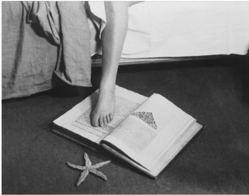
Fig. 1. Man Ray, foot on book at 11:17-11:22, film still from L'Etoile de mer (1928)

I had always been intrigued by this image because most of the film was shot through gelatin to produce “surreal” distortions preventing close observations of details. This shot, however, is one of several in relatively sharp focus, as if to invite close reading intermittently throughout the film. Initially, I was chiefly concerned with finding a prototype for the action of stepping on a book. After some time, I discovered the frontispiece to the Marquis de Sade’s Justine, ou les malheurs de la vertu , a copy of which was, according to painter André Masson, on the mantel over the fireplace in 15, rue de Grenelle, Paris—the so-called Bureau of Surrealist Research—along with Freud’s Introduction à la psychanalyse and Lautréamont’s Les Chants de Maldoror . 19 In it, the personification of Virtue is corrupted by Luxury and Irreligion, whose identity is revealed by a foot trampling a Bible with a cross nearby. Consequently, I was content with the idea that the shot merely represented surrealist anti-clericalism, 20 but other aspects of the surrealist enterprise began to cloud the issue. One such was a caption repeated in Max Ernst’s collage-novel La Femme 100 têtes , “the phantom of repopulation,” that functioned in a manner rather like that of an intertitle in a film. 21 “Repopulation” conjured up associations with the contemporary French policy of natalism, and I began to wonder whether others in the surrealist orbit were aware of politically and socially conservative attempts