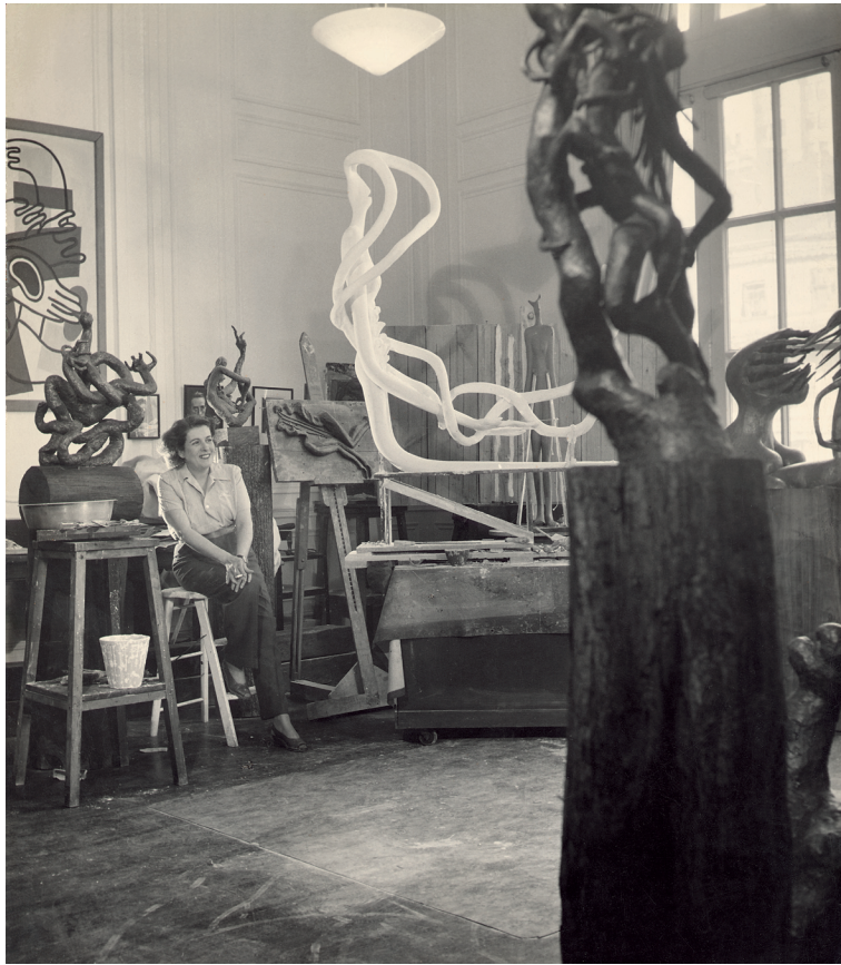
Fig. 1. Anonymous, Maria Martins in her New York studio, c.1946, Gelatin-silver print, courtesy of Francis M. Naumann Fine Art, New York

inscription of Brazil “as a savage territory which, once civilized, would be a necessarily muddy copy of Europe. The use of the cannibal metaphor permits the Brazilian subject to forge his specular colonial identity into an original (as opposed to dependent, derivative) national culture. Oswald’s anthropophagist – himself a cannibalization, not of Rousseau’s idealized savage but of Montaigne’s avowed and active cannibal – neither apes nor rejects European culture, but “devours” it, adapting its strengths and incorporating them into the native self.” 4 Proclaiming Brazil to be a nation of cultural cannibals, Oswald de Andrade offered a solution for his country’s perceived cultural inferiority by polemically recasting cannibalism as a positive cultural practice that would lead to the creation of an authentically national expression.