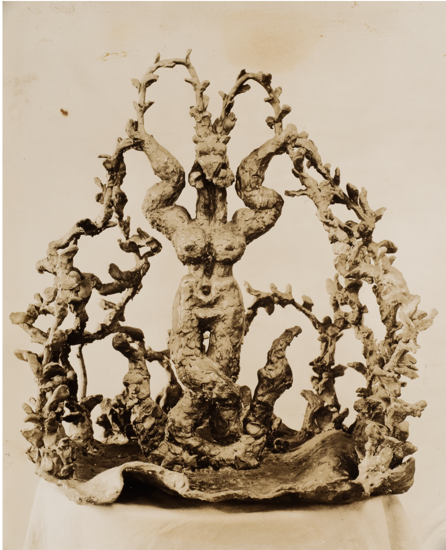
Fig. 4. Maria Martins, Aioká , 1942, bronze.

Her Bachelors, Even , otherwise known as The Large Glass , in the modern wing of the Museum. Following Duchamp's specific instructions, behind The Large Glass a small doorway was installed that led onto a balcony, allowing visitors to walk outside the gallery designed for his work and take in a commanding view of Martins' sculpture on the East Terrace below. 16 Sadly, the experience of seeing this extraordinary juxtaposition of Duchamp's Large Glass and Martins' standing nude sculpture Yara is no longer possible, since the latter was vandalized in 1992, exactly fifty years after it